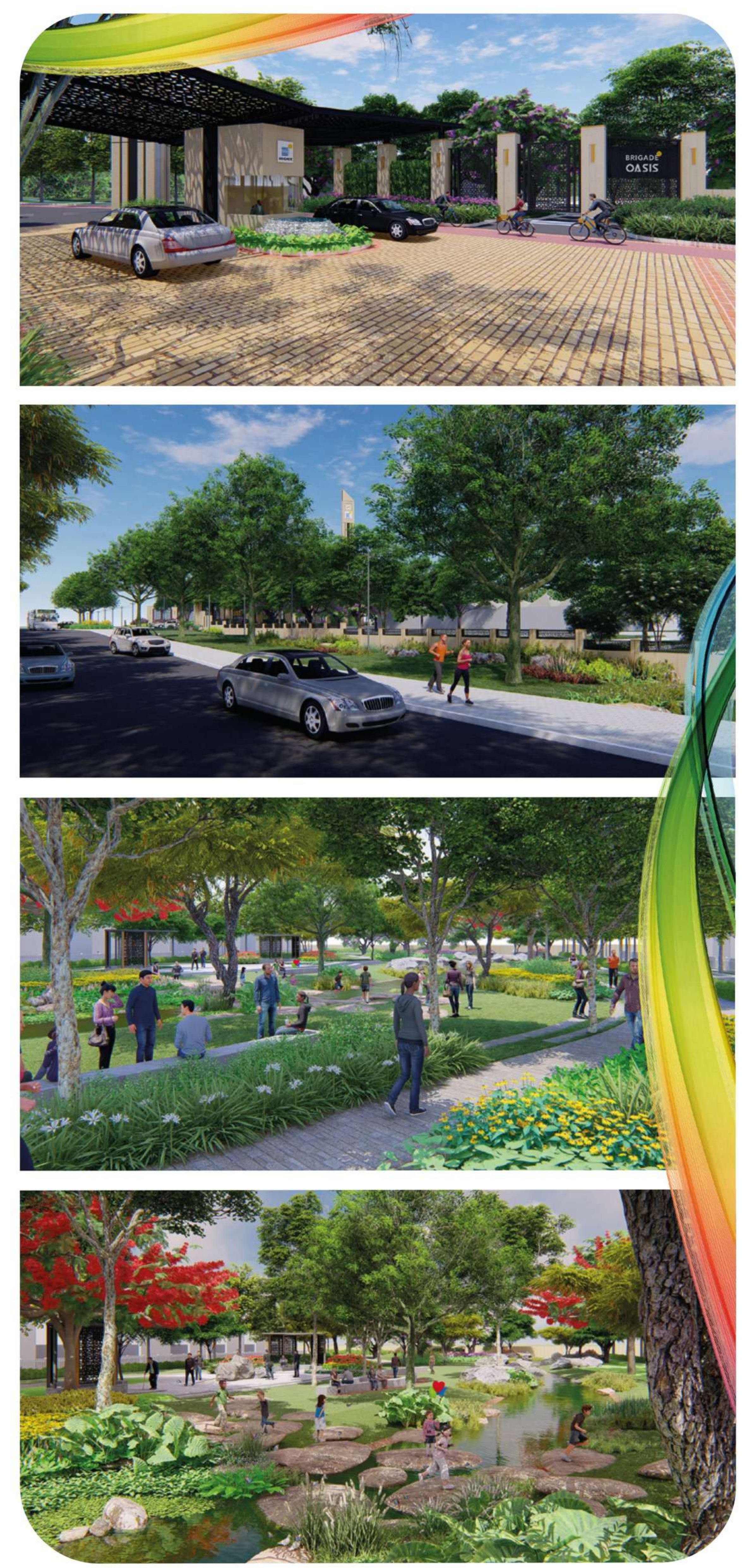
Artist's Impressions Disclaimer: All materials shown are indicative only