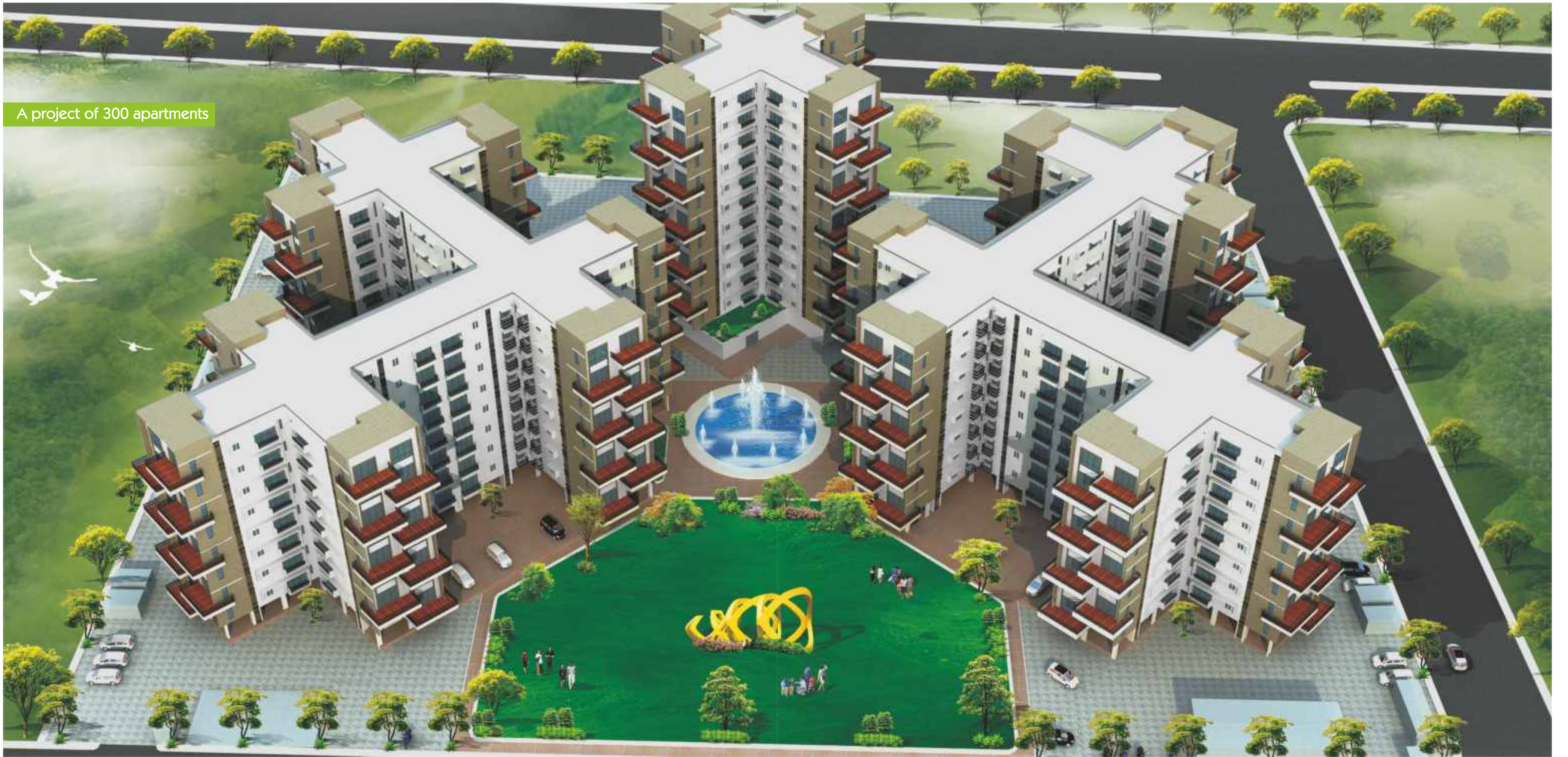
A project of 300 apartments