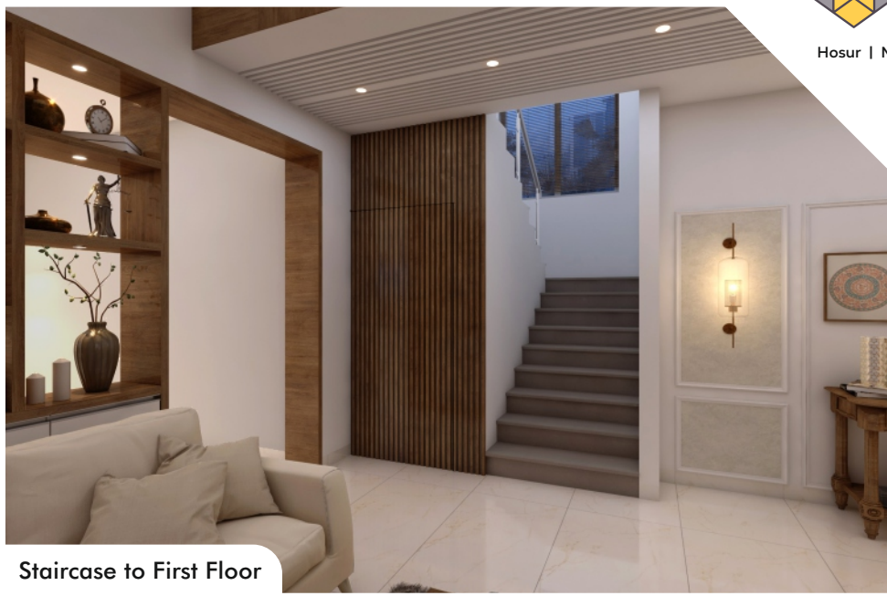
Staircase to First Floor

Architecture & Construction by THE SOUL WALLS Hosur | Madurai | Hyderabad