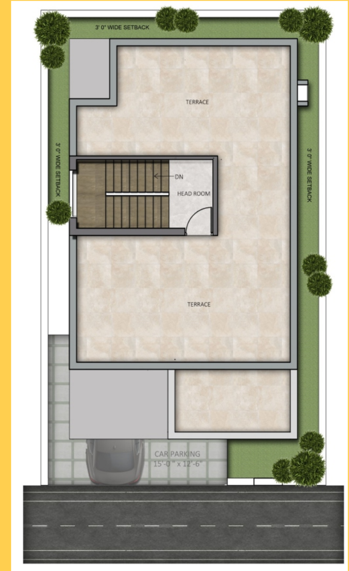
Terrace Floor Plan