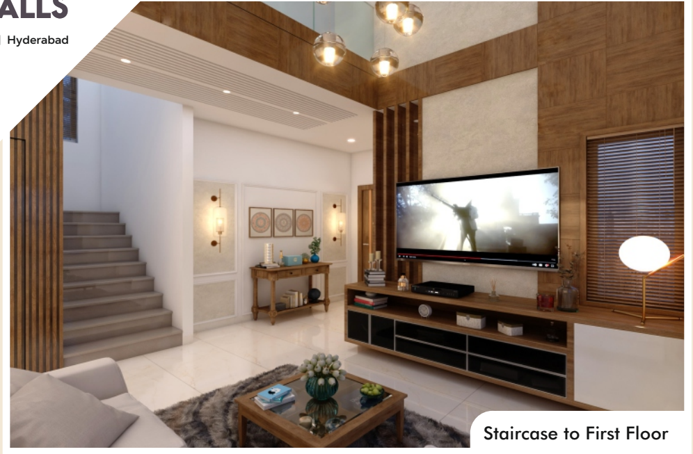
Staircase to First Floor