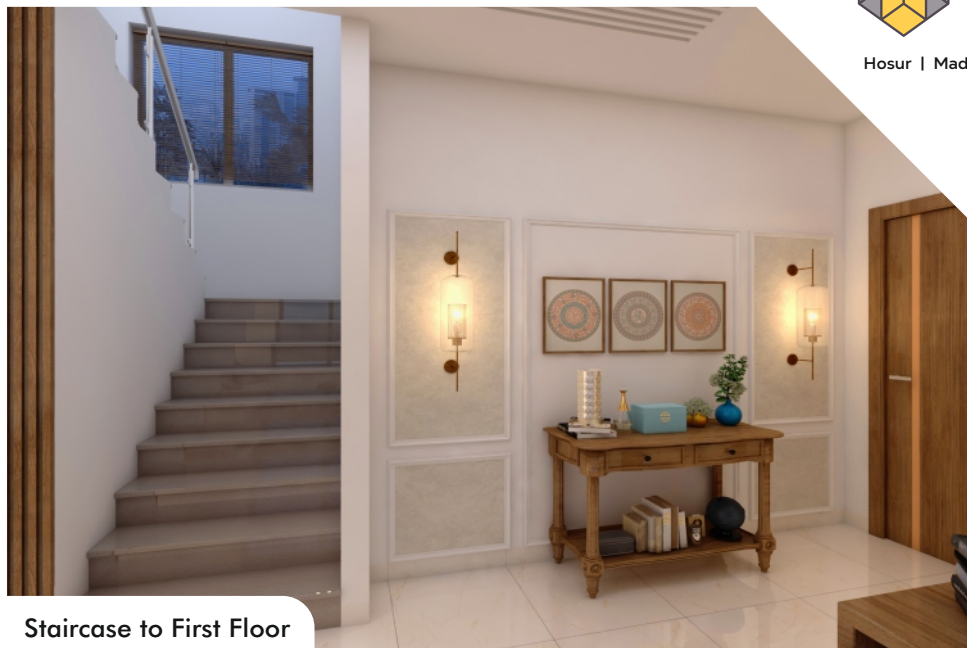
Staircase to First Floor

Architecture & Construction by THE SOUL WALLS Hosur | Madurai | Hyderabad