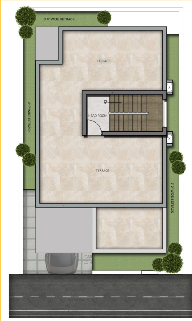
Terrace Floor Plan