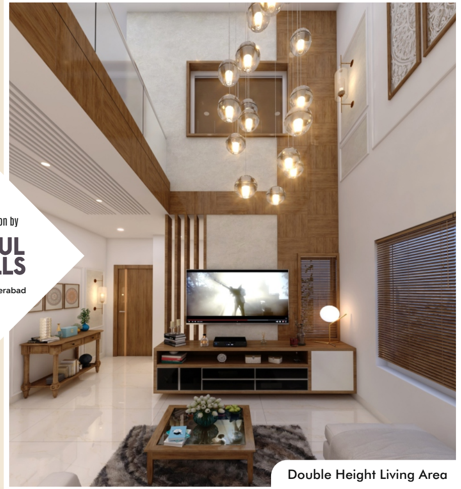
Double Height Living Area