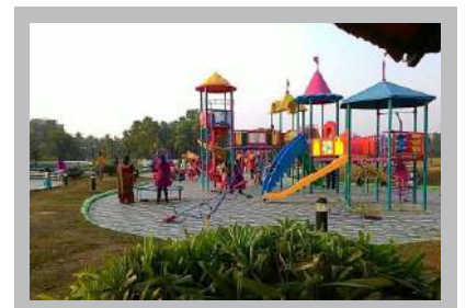
Rides for Kids