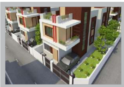
TWO SIDE OPEN VILLA