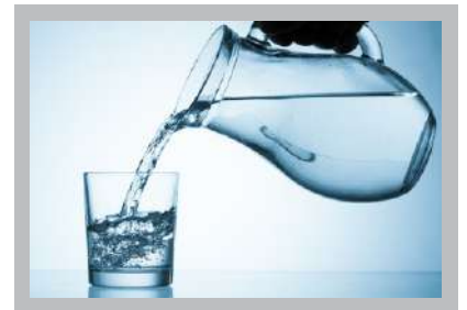
24X7 WATER SUPPLY