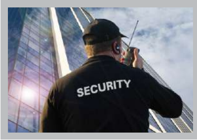
24X7 ADVANCED SECURITY