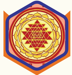
VAASTU COMPLIANT PLANNING