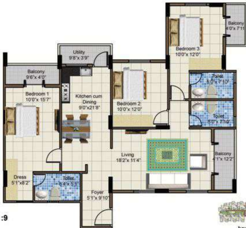
Typical Unit No :9 East Facing