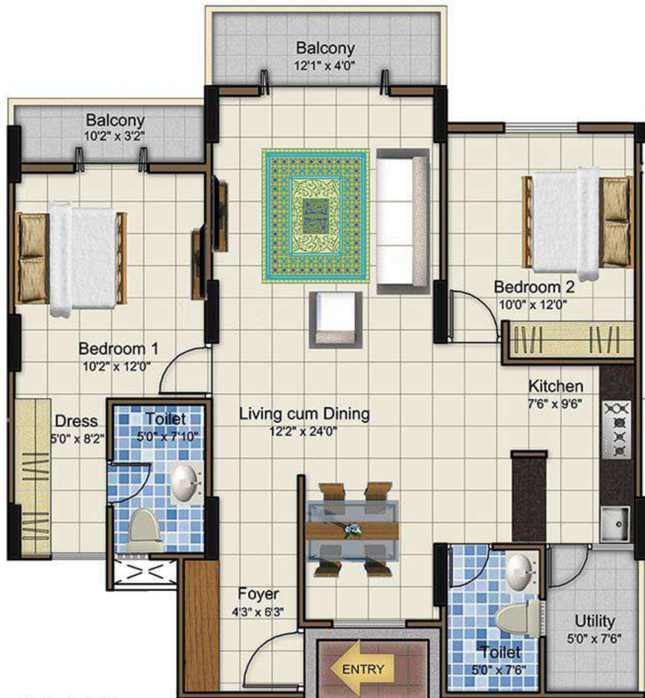
Typical Unit No :2,3,4,6,7 East Facing