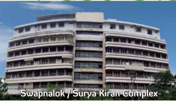
Swapnalok / Surya Kiran Complex