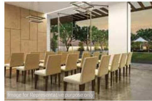
Banquet hall that opens into the lawn