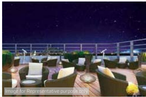
Sky lounge and Stargazing deck