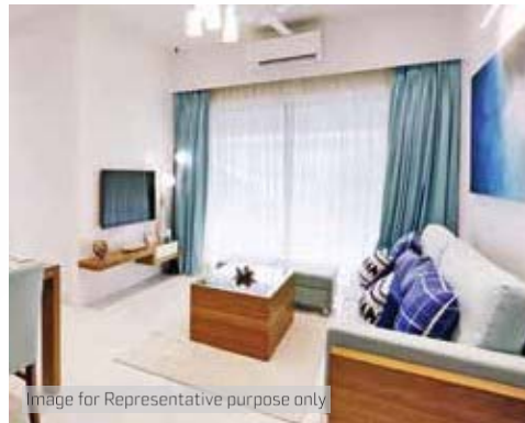
Actual Show Flat Photo