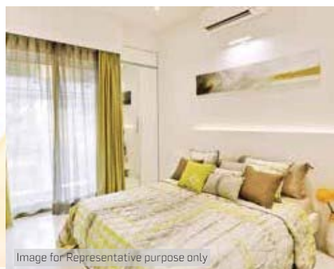
Actual Show Flat Photo