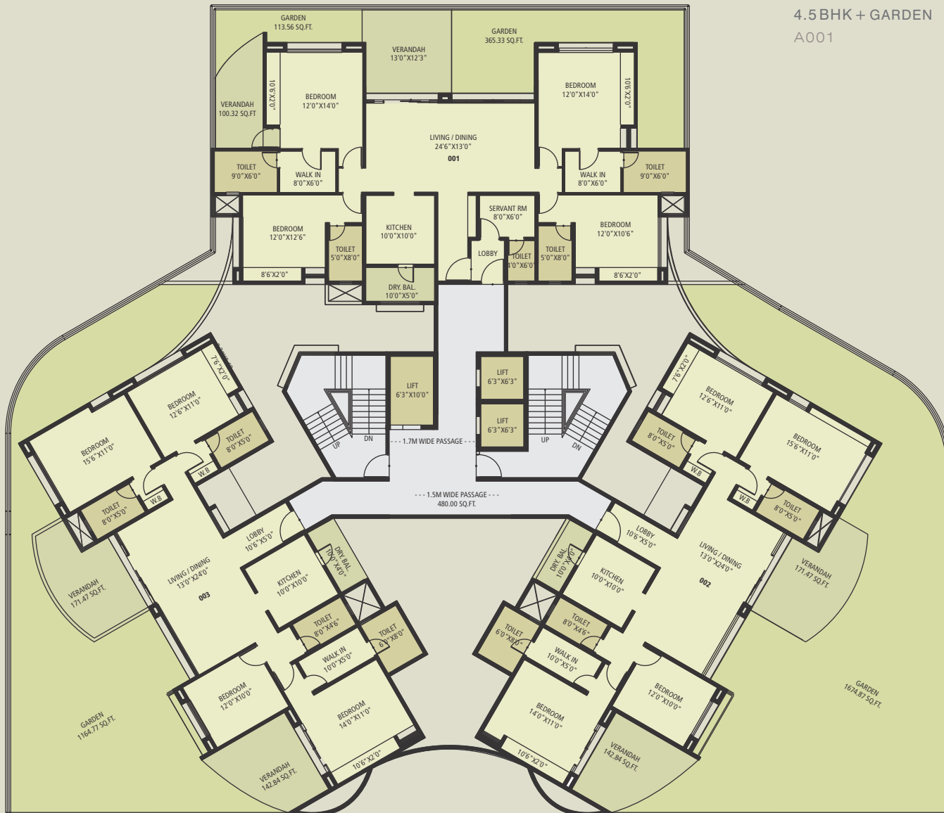
4.5 BHK + GARDEN A001