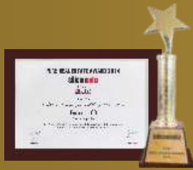
Best Mid-range Project of The Year West Pune 2013-14