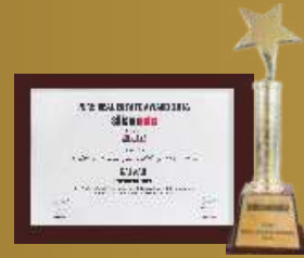
Best Mid-range Project of The Year West Pune 2015-16