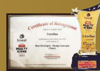
Best Developer - Design Concepts Pune 2020-21