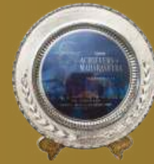
Sakal Achievers of Maharashtra 2018-19