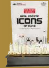
Real Estate Icon of Pune 2018-19