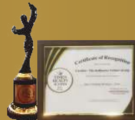
Best Emerging Developer Pune 2019-20