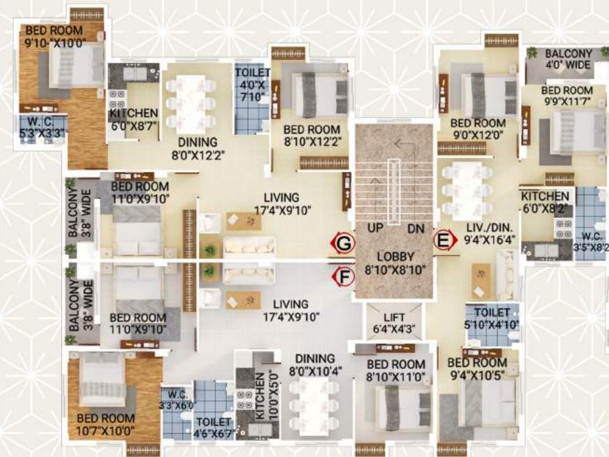
2ND - 4TH FLOOR PLAN