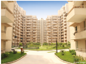
THE LEGEND, GURUGRAM Premium Residential Group Housing