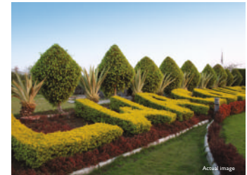
MALWA COUNTY PHASE II INDORE 110 Acre Integrated Township