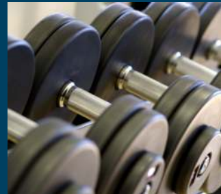
Gym & health zone