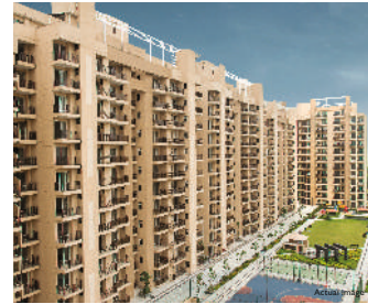
THE HERMITAGE, GURUGRAM Group Housing Development Sector 103