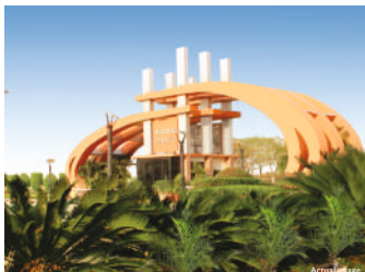
MALWA COUNTY, INDORE 110 Acre Integrated Township