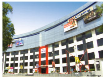
CITY CENTRE, BATHINDA Shopping cum Entertainment Centre