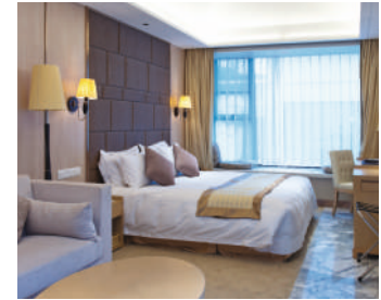
NORA, GURUGRAM One Room Apartments at The Hermitage