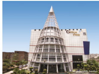
CENTRUM PLAZA, GURUGRAM Premium Office Complex