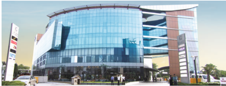
THE GALAXY, GURUGRAM 5-star Hotel, Shopping & Spa