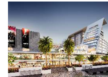
THE HIVE, GURUGRAM Integrated Commercial Complex