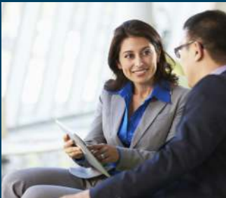
Business centre & lounge