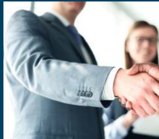
Professional facility management