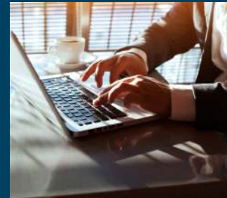
Broadband & internet connectivity