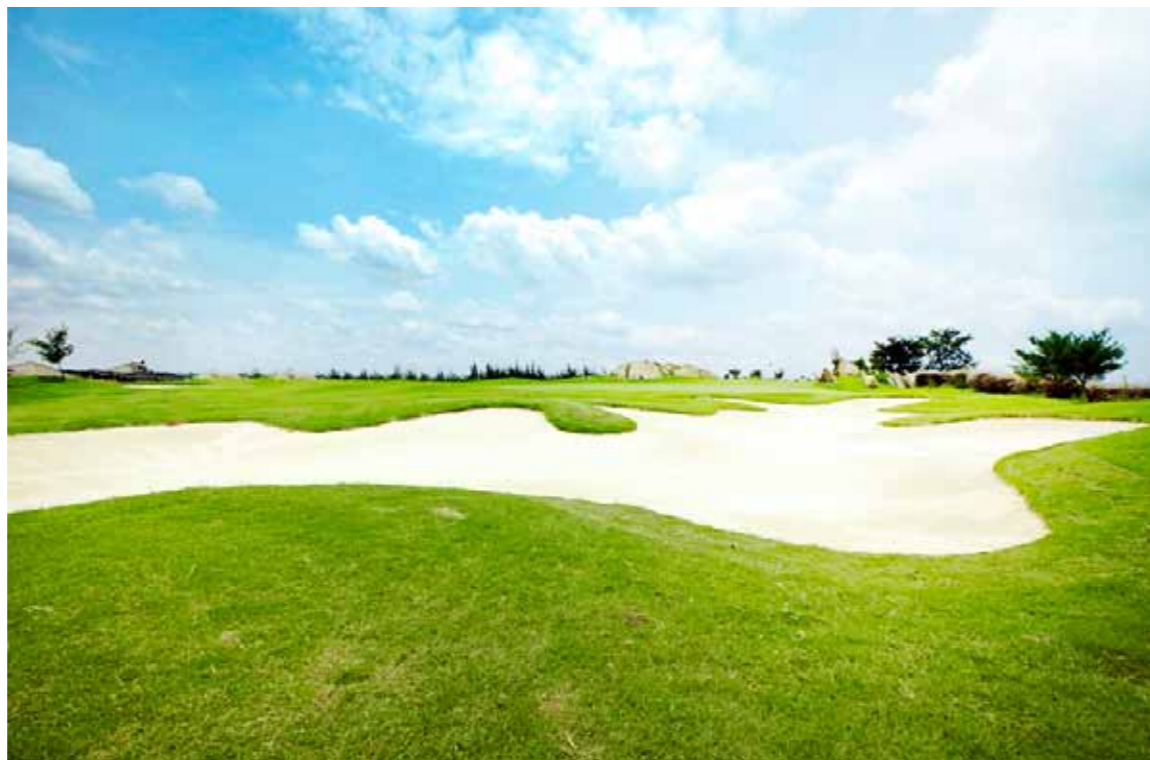
Actual photographs of the Clover Greens Golf Course

Clover Greens Private Limited and Hill Ridge Estates, which are owned by the above individuals, are responsible for long term ownership and maintenance of the golf course and the club house.