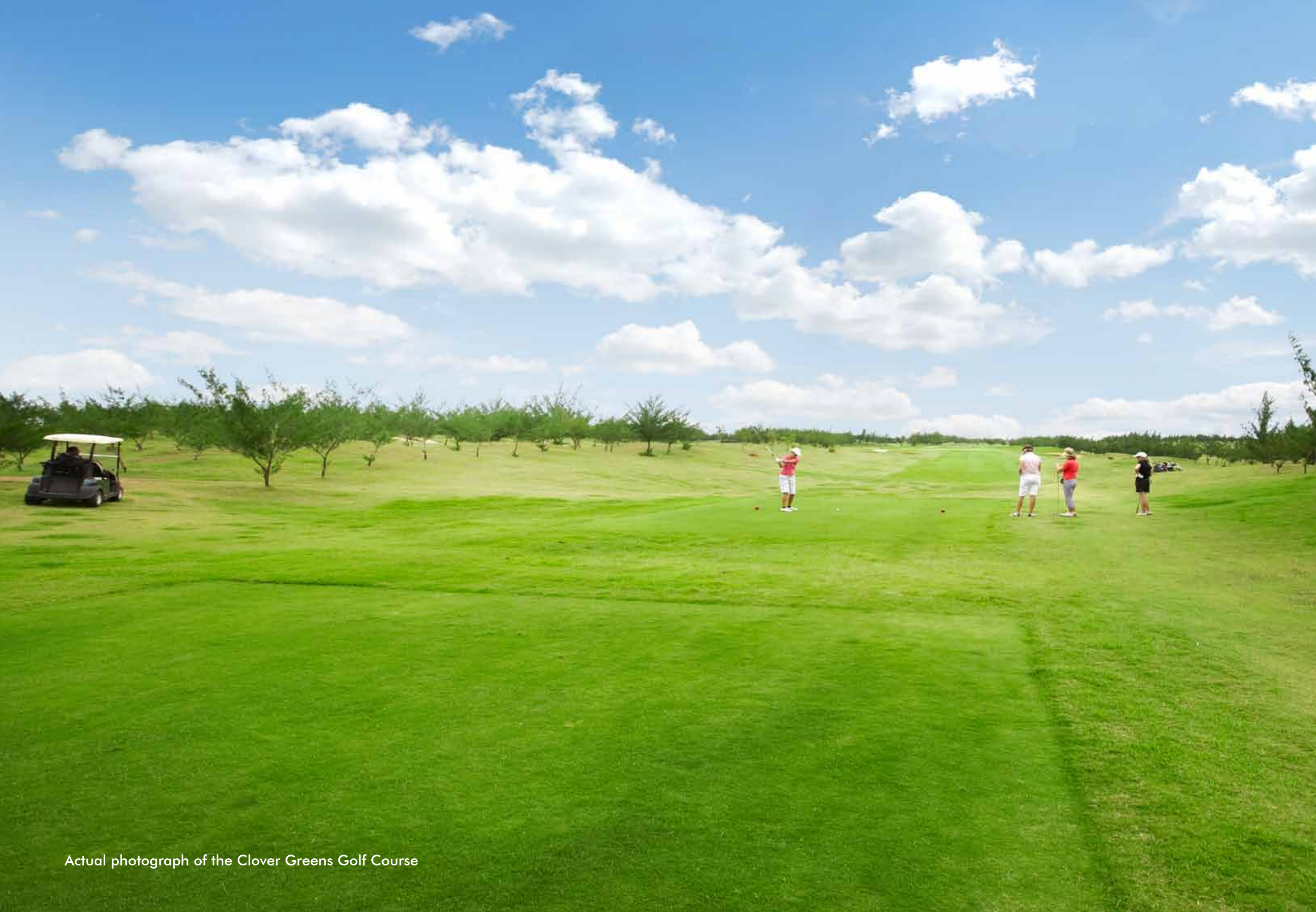
Actual photograph of the Clover Greens Golf Course