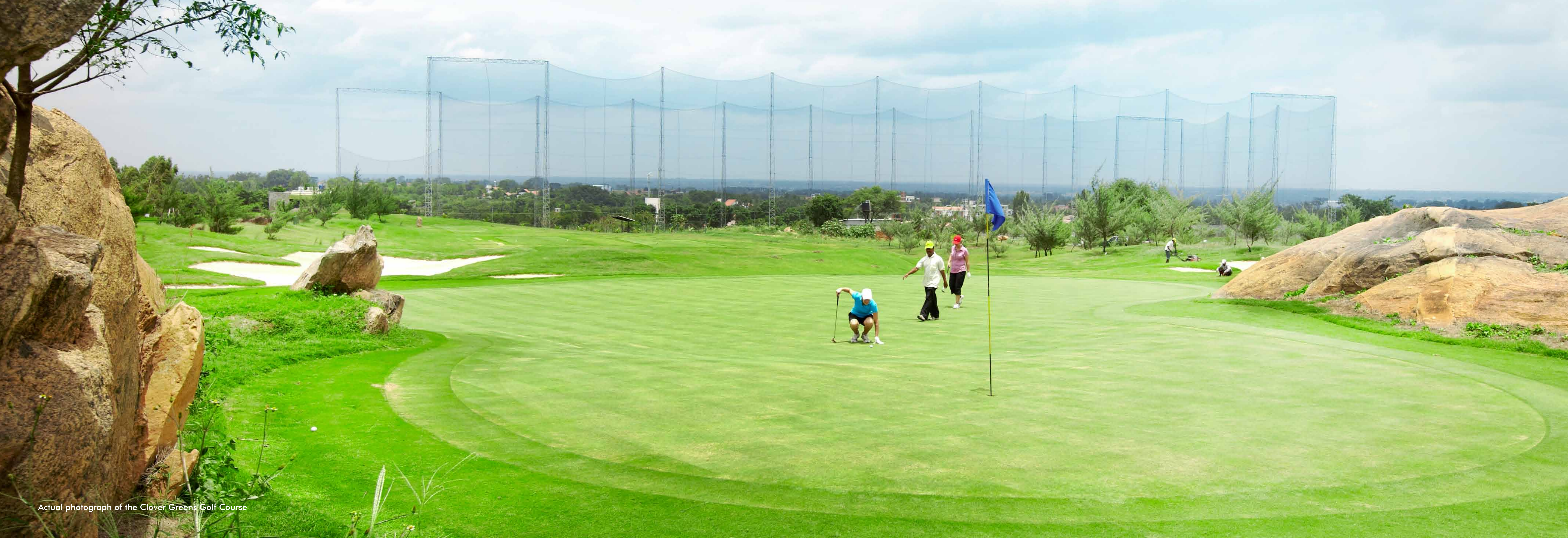
Actual photograph of the Clover Greens Golf Course