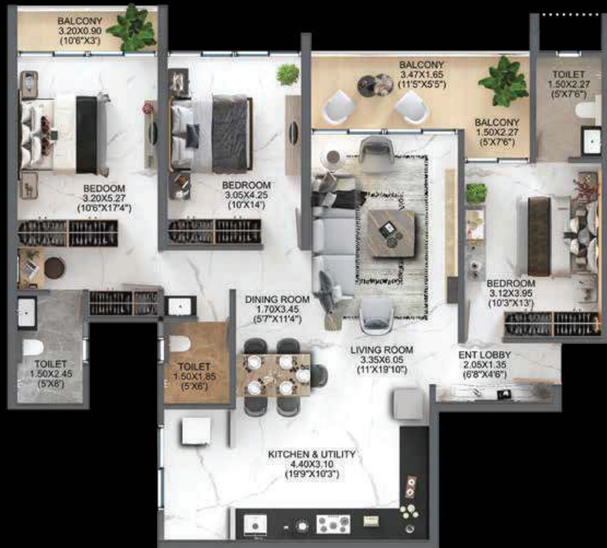
3 BHK Majestic 1300 Sq.ft. Carpet Area