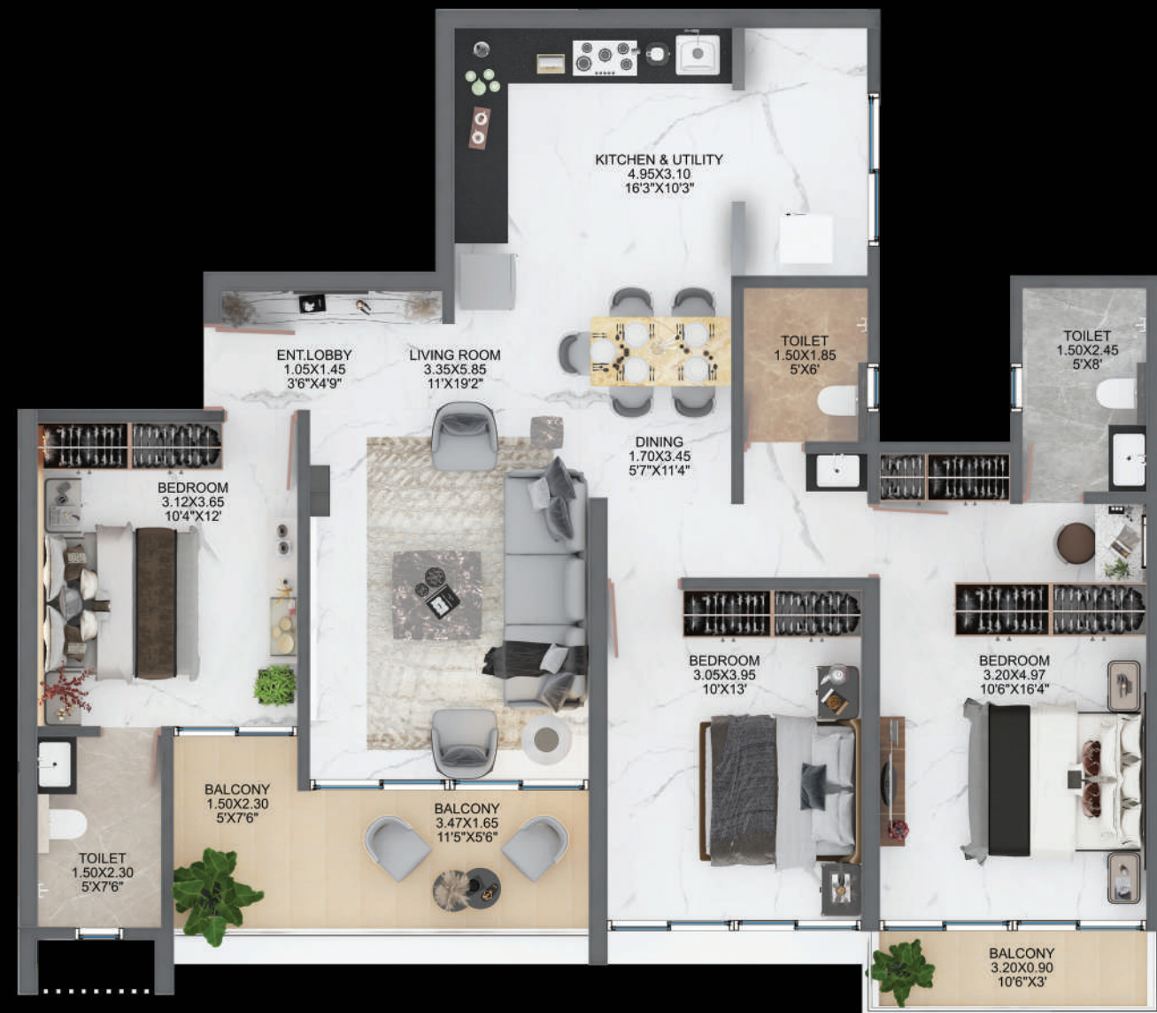
3 BHK Crown 1209 Sq.ft. Carpet Area