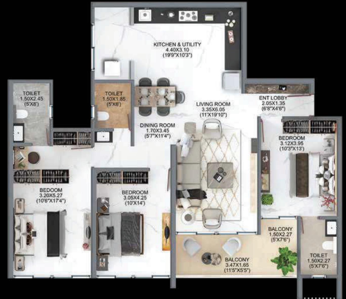
3 BHK Royal 1264 Sq.ft. Carpet Area