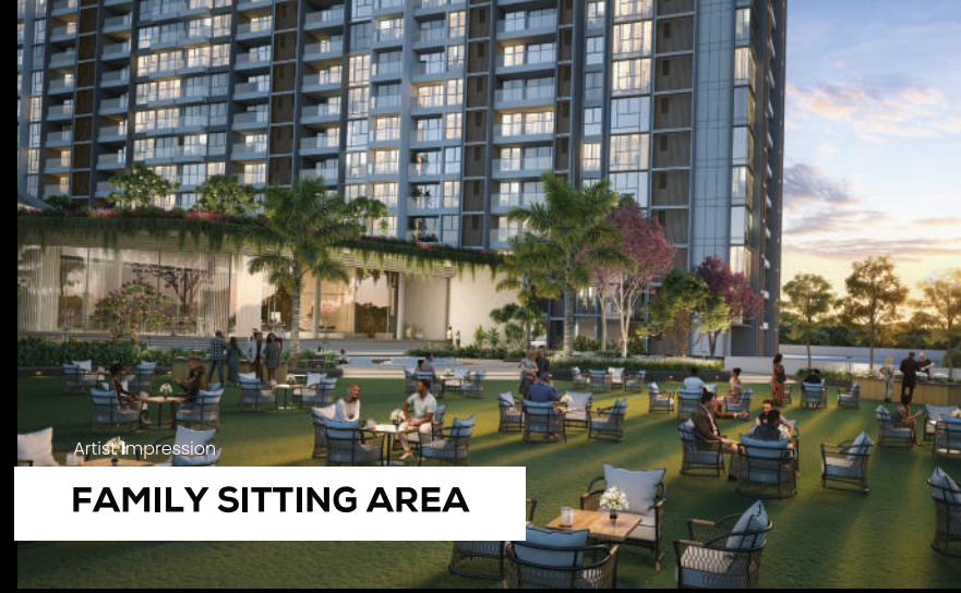
FAMILY SITTING AREA