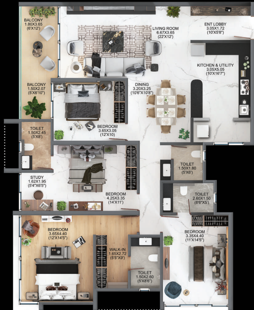
4 BHK Grandeur 1715 Sq.ft. Carpet Area