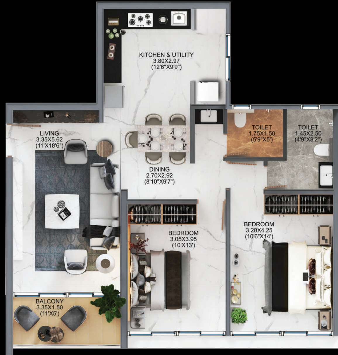
2 BHK Grandeur 877 Sq.ft. Carpet Area