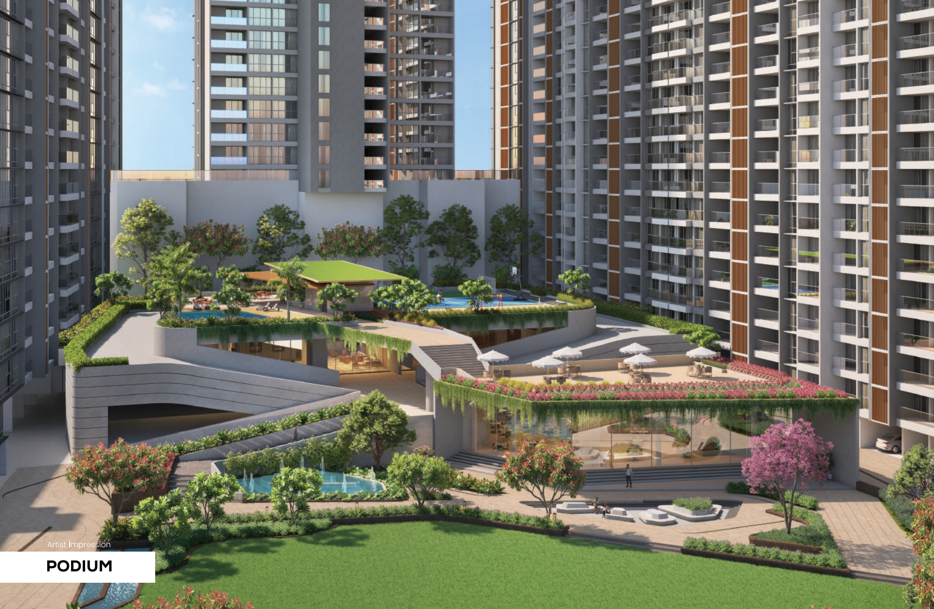
Artist Impression PODIUM