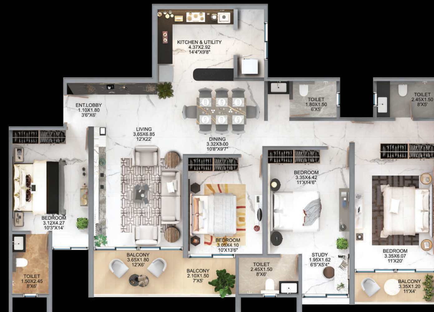
4 BHK Opulence 1684 Sq.ft. Carpet Area