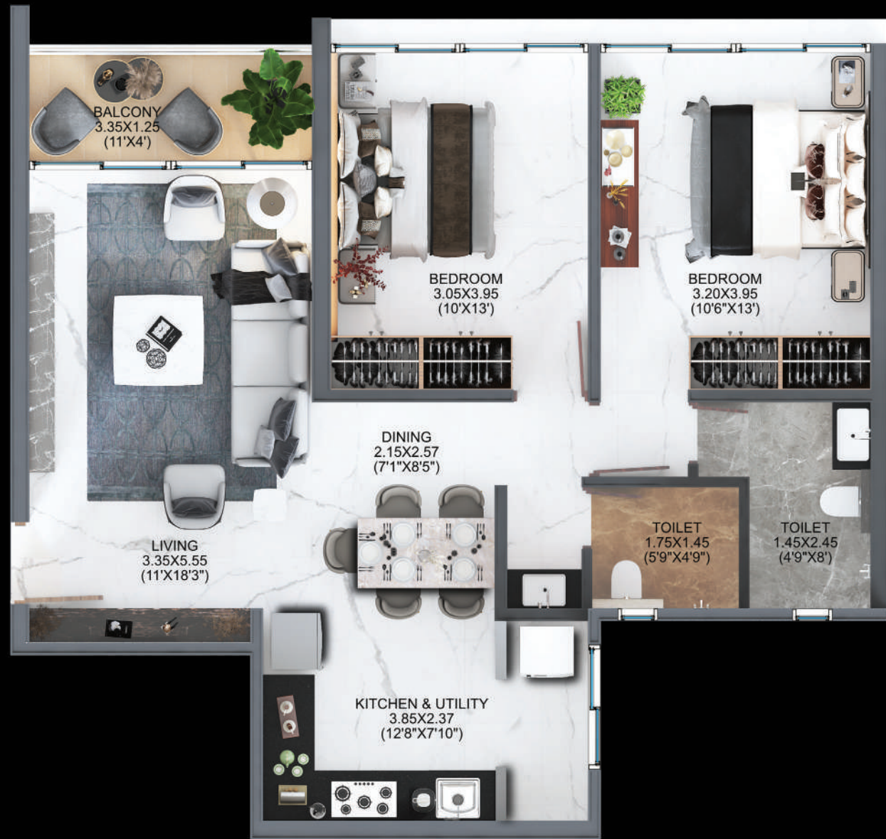
2 BHK Deluxe 815 Sq.ft. Carpet Area