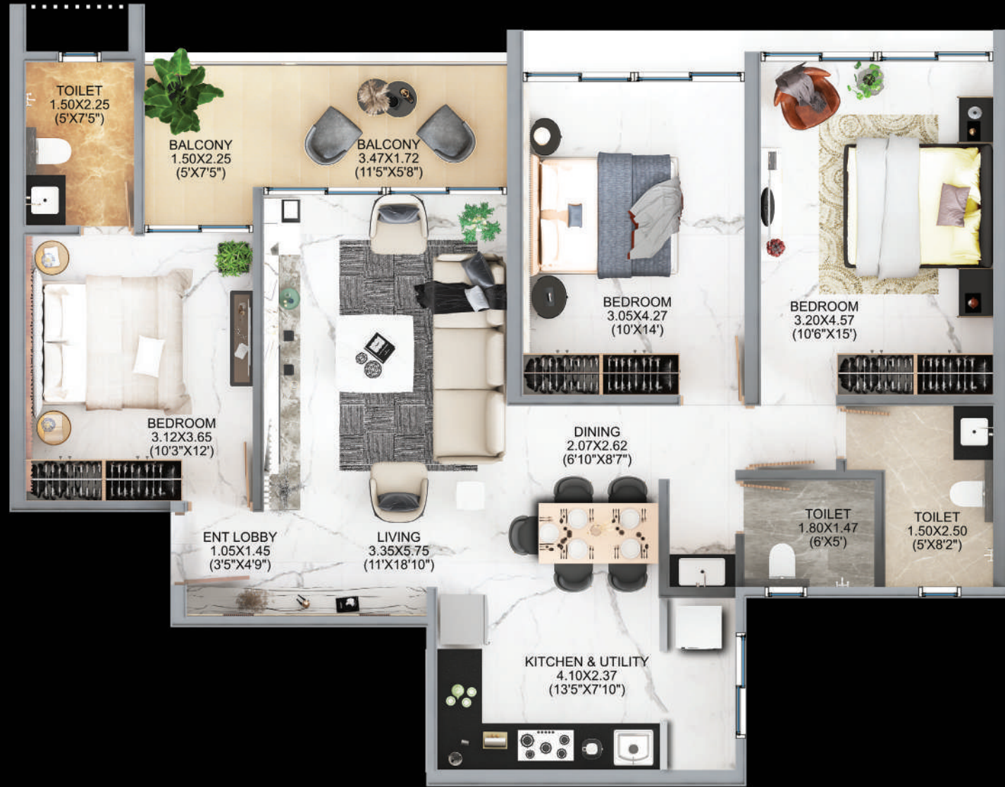
3 BHK Supreme 1115 Sq.ft. Carpet Area