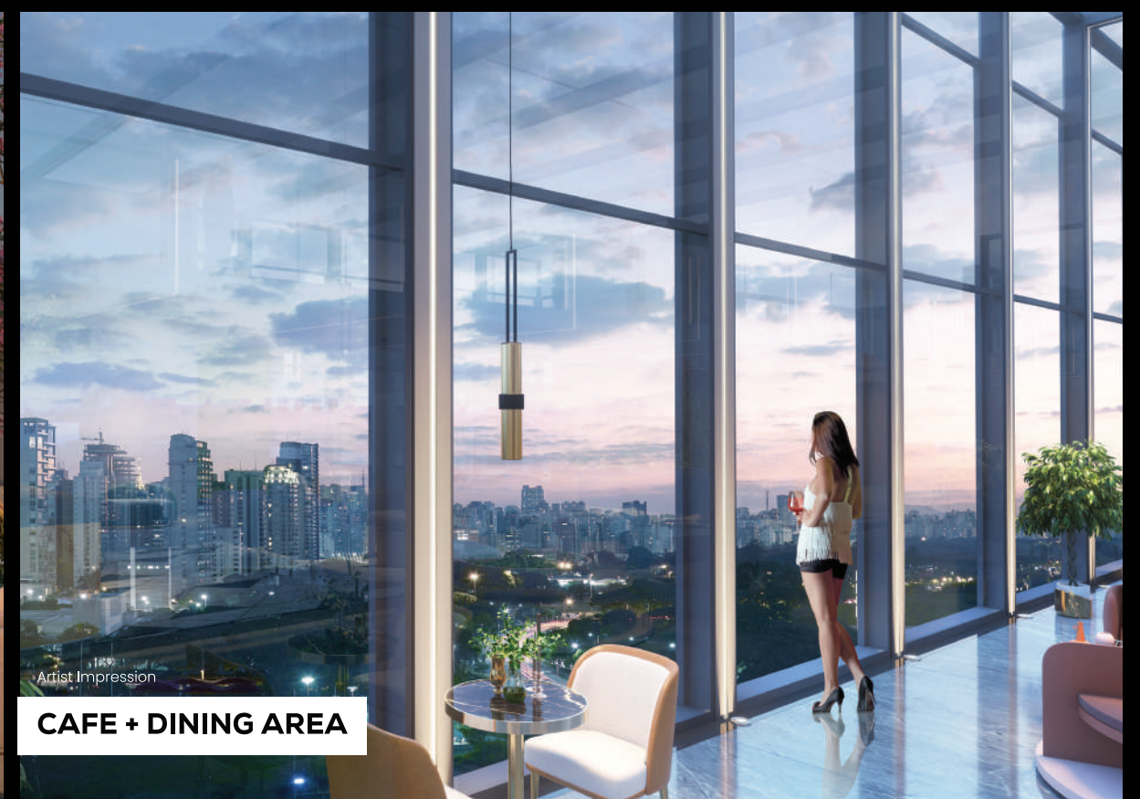
Artist Impression CAFE + DINING AREA