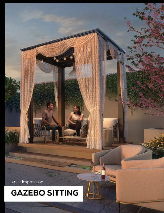
Artist Impression GAZEBO SITTING