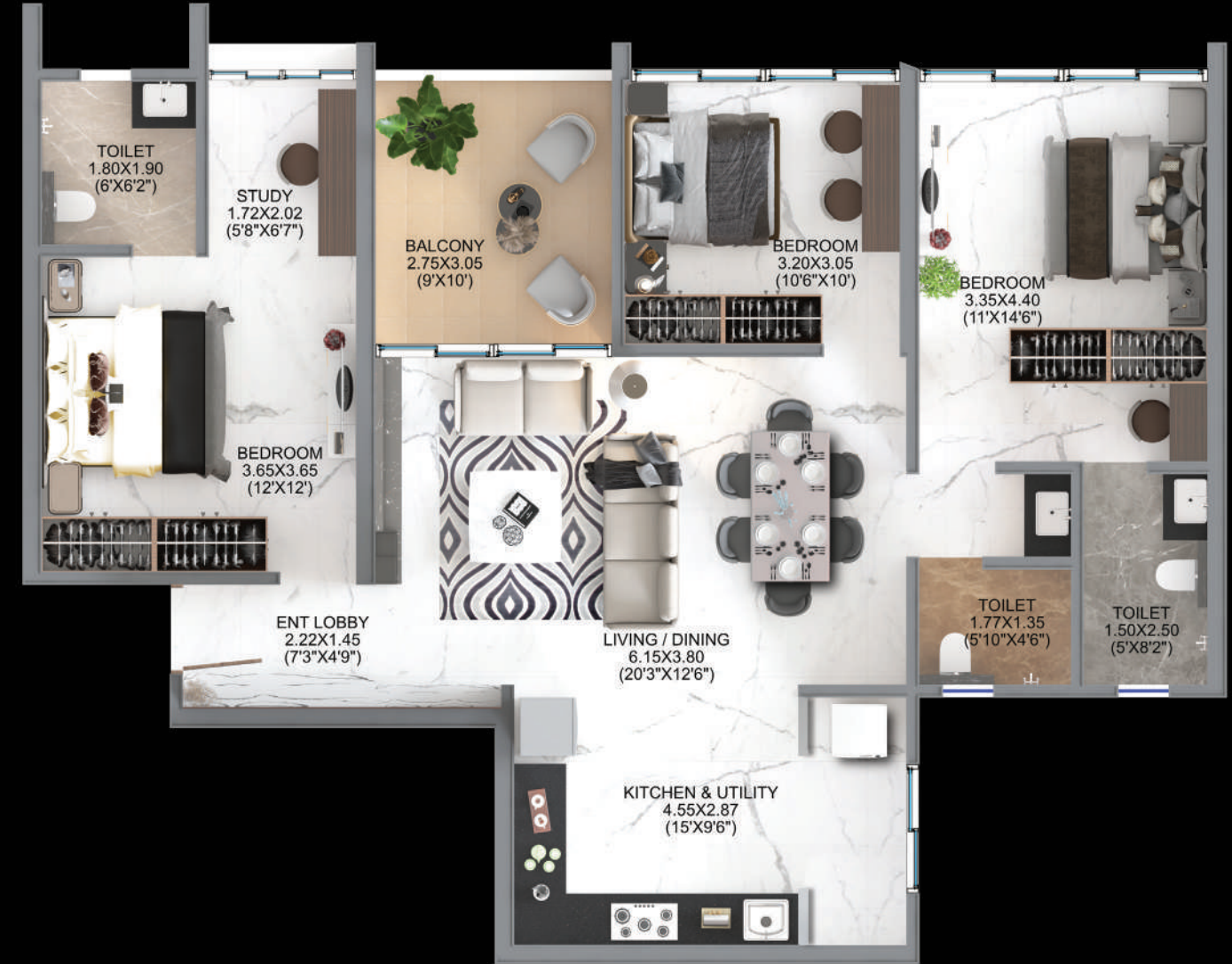
3 BHK Luxe 1149 Sq.ft. Carpet Area