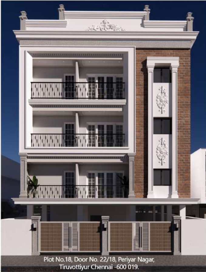
Plot No.18, Door No. 22/18, Periyar Nagar, Tiruvottiyur Chennai -600 019.

From Concepts to Creation, We Build Your Dreams