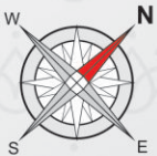
— 11TH FLOOR PLAN —