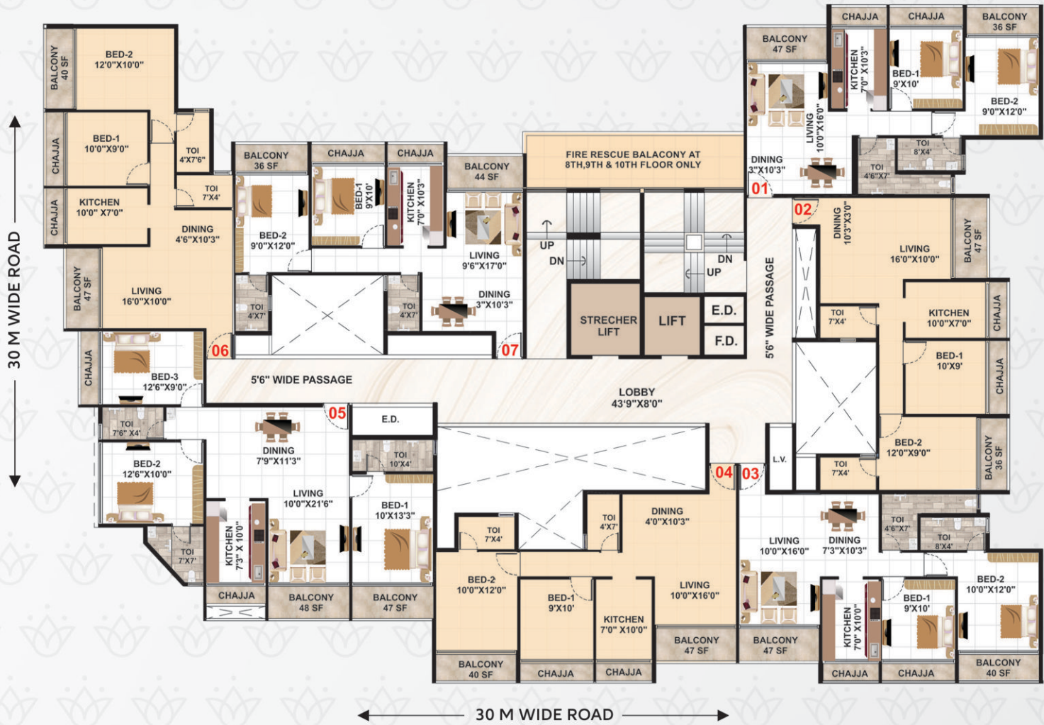
— 3RD TO 10 TH FLOOR PLAN —