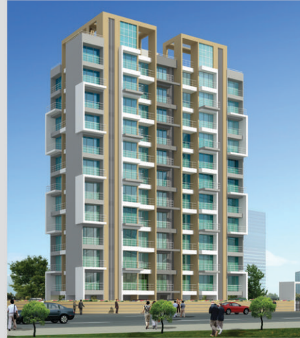
Star Galaxy, Plot-30, Sector-18, Ulwe, Navi Mumbai.