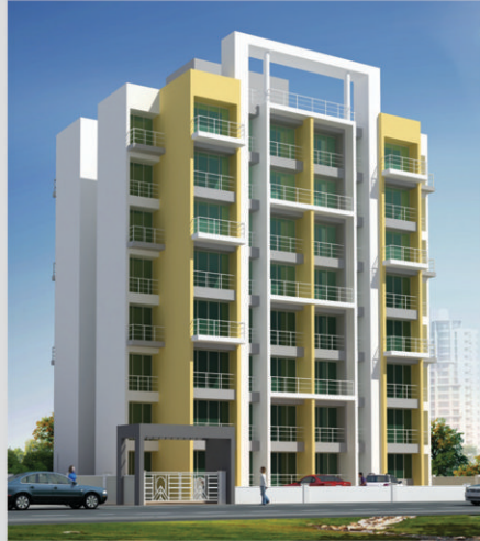
Shree Chamunda Dham, Plot-67A & 67B, Sector-19, Ulwe, Navi Mumbai.