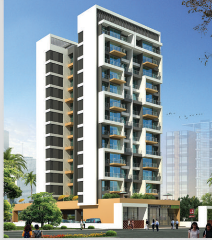
Kasturi Heritage, Plot-F37, Sector-8, Ulwe, Navi Mumbai.