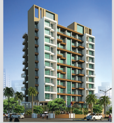
Sapphire, Plot-C2, Sector-8, Ulwe, Navi Mumbai.