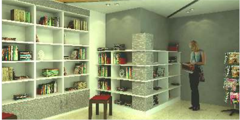
LIBRARY & RECREATION ZONE