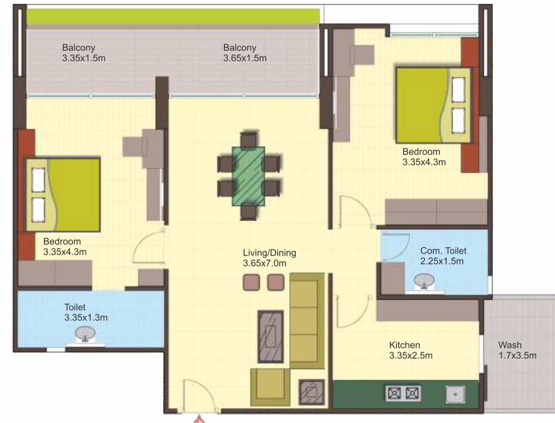
2 BHK Block - A / B SUPER BUILT UP AREA 1430 SQ. FT. 132 SQ. M. (Approx) (Approx)