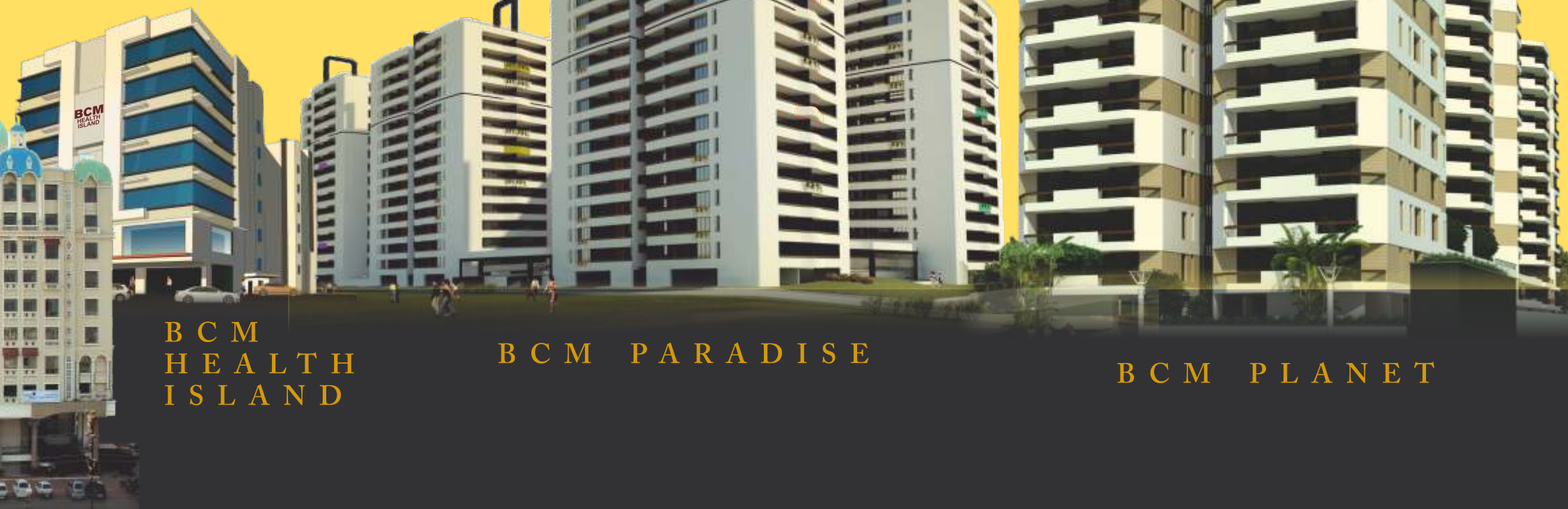
BCM HEALTH ISLAND