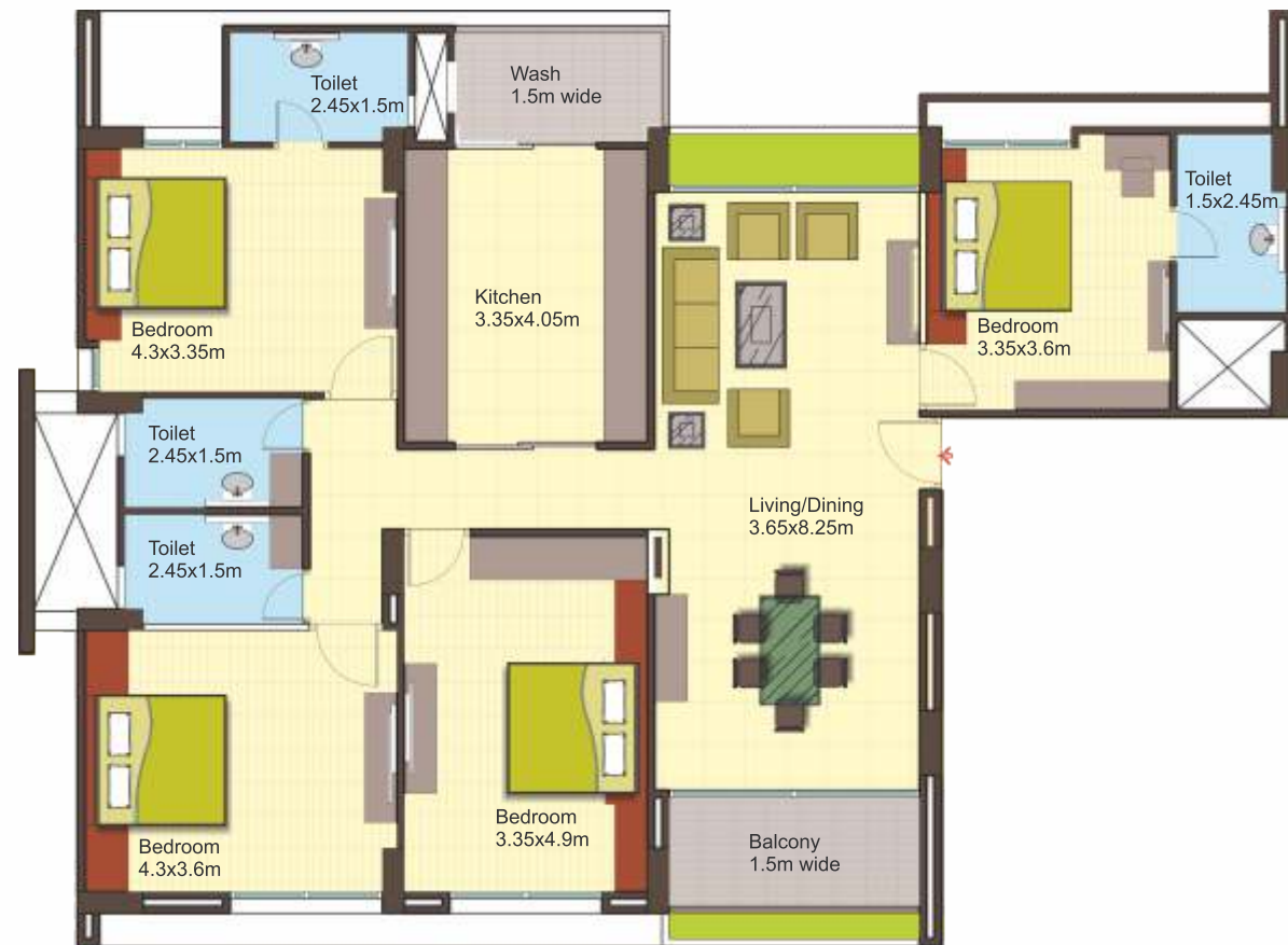
4 BHK Type - 2 Block - C SUPER BUILT UP AREA 2223 SQ. FT. 206 SQ. M. (Approx) (Approx)