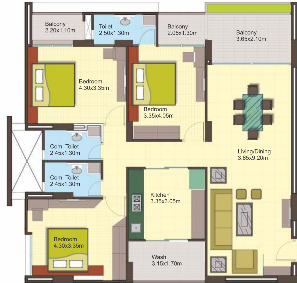
3 BHK Block - A / B SUPER BUILT UP AREA 2032 SQ. FT. 188 SQ. M. (Approx) (Approx)