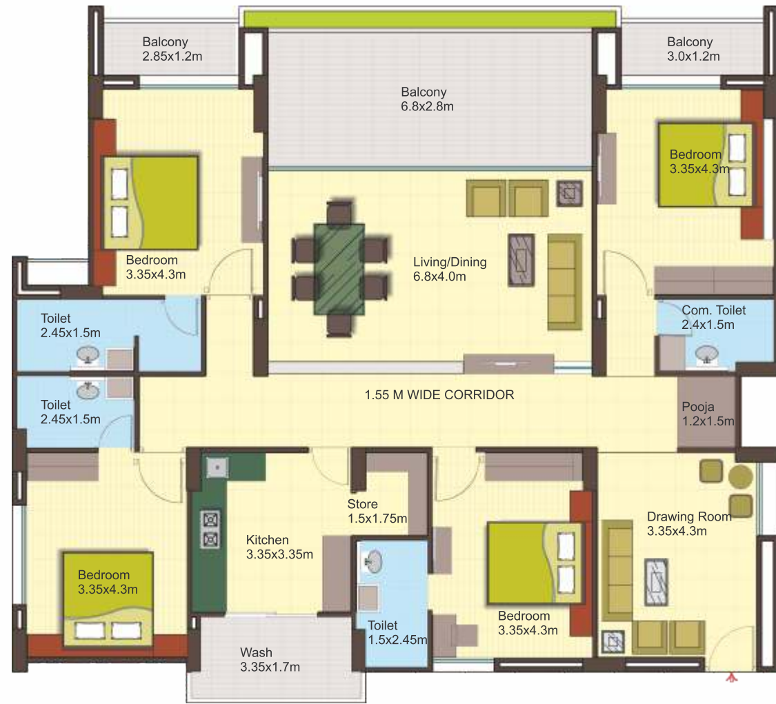
4 BHK Type - 1 Block - E SUPER BUILT UP AREA 3103 SQ. FT. 288 SQ. M. (Approx) (Approx)