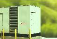
POWER BACK-UP FOR COMMON LIGHTING