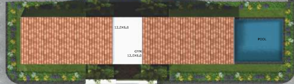
Clubhouse (Block D)