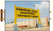
Sevvaipet Railway Station