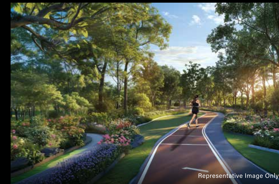
Representative Image Only