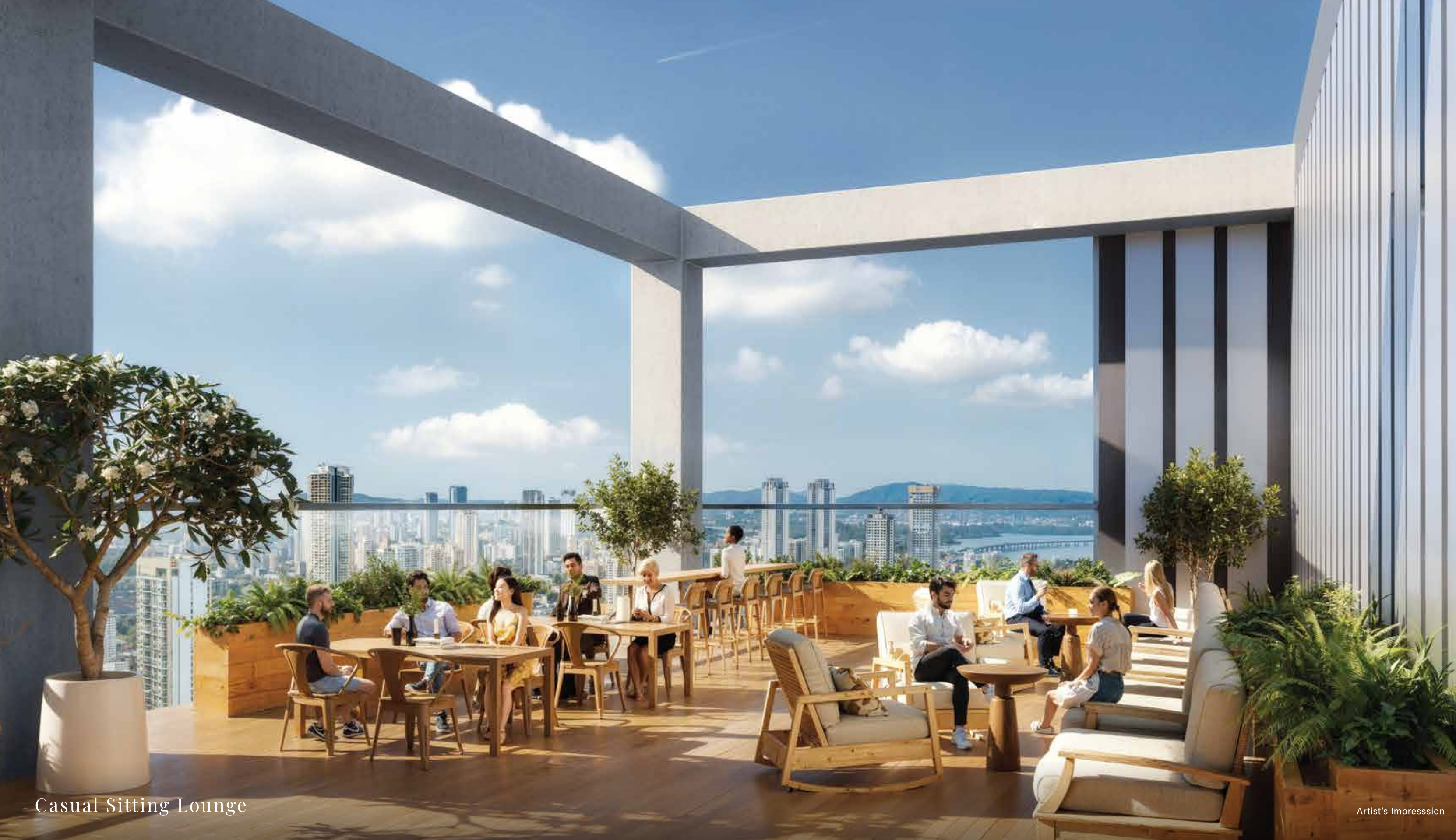
Casual Sitting Lounge