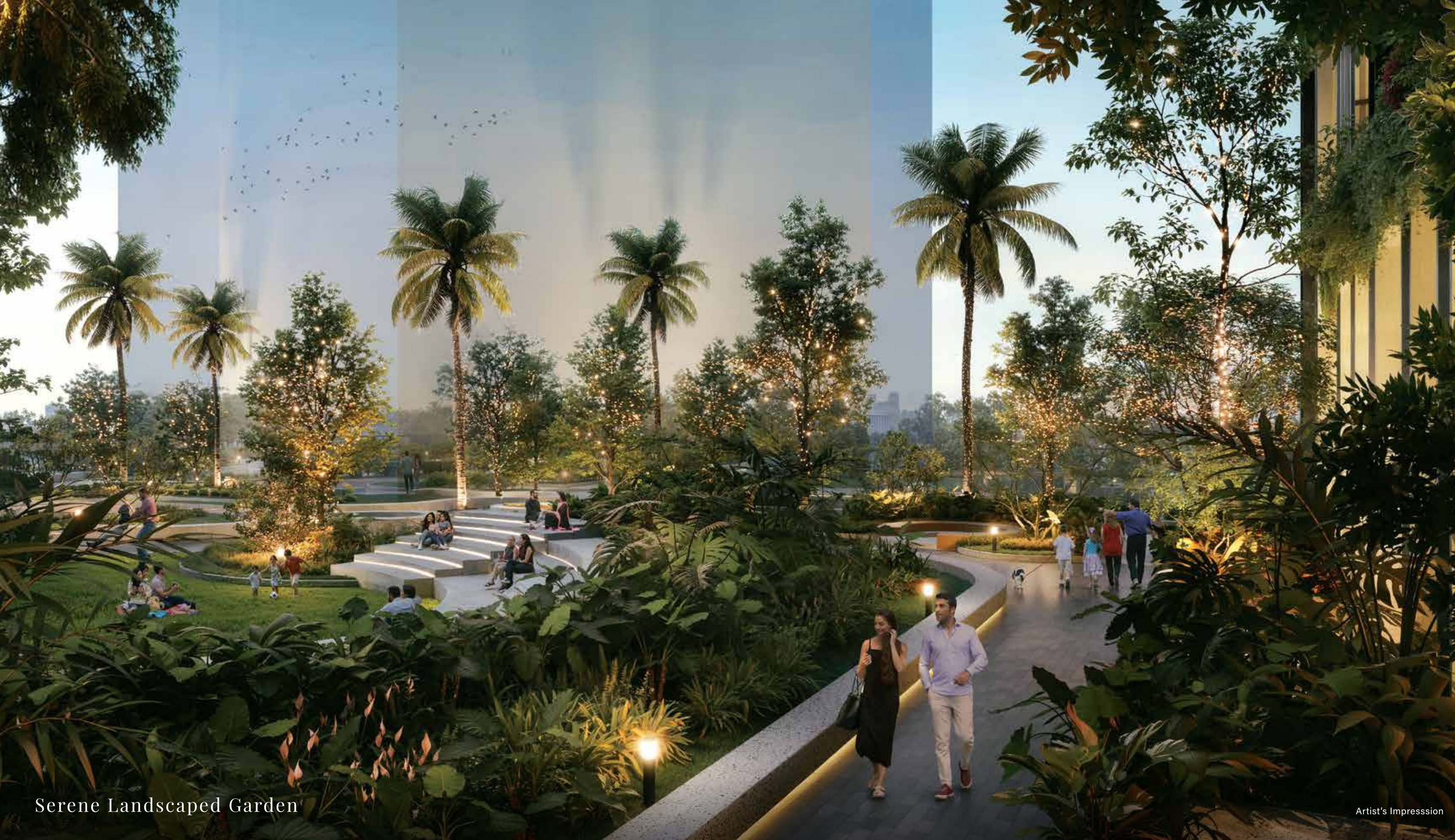
Serene Landscaped Garden