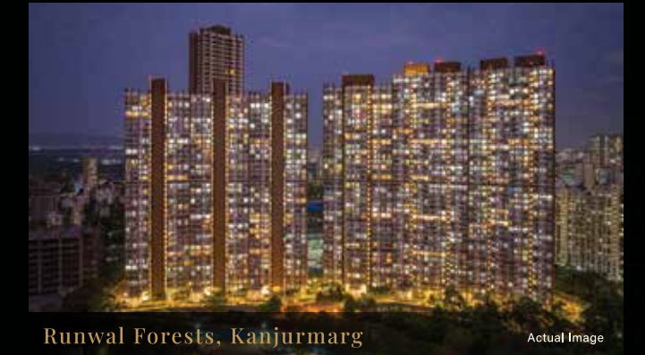
Runwal Forests, Kanjurmarg

A perfect blend of fine living, sought-after comforts, high-street delights and green open spaces. Part of the sprawling 36-acre Runwal City Centre, it's your venue to lead the good life.