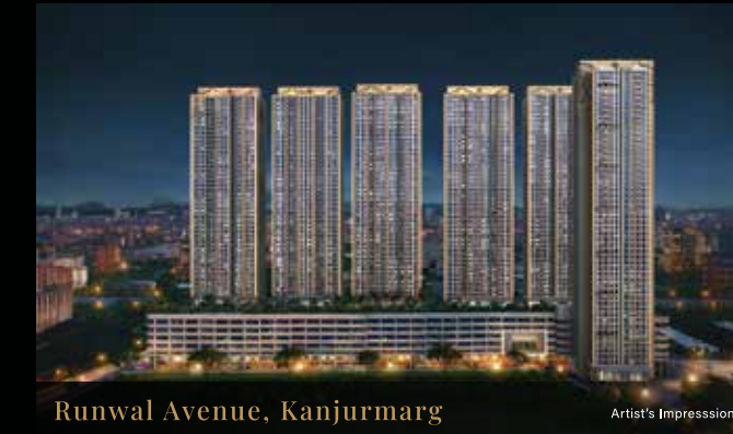
Runwal Avenue, Kanjurmarg

Nestled within the 36-acre large Runwal City Centre, Runwal Bliss is built on the live, learn, work, play ethos. It features stunning residences, beautifully landscaped open areas and exceptional recreational amenities.