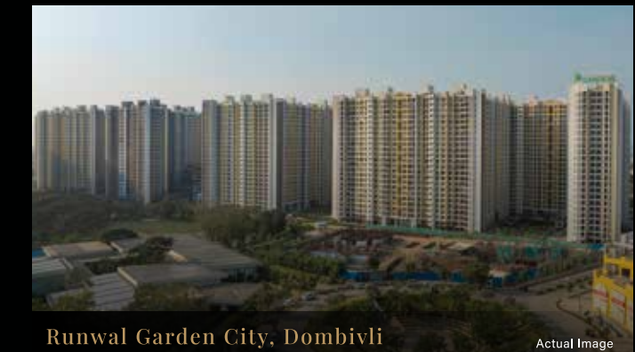
Runwal Garden City, Dombivli

The finest high-rise address in the eastern suburbs of Mumbai. Embrace breathtaking views, cleaner air and tranquil surroundings in elegantly crafted homes. Experience a life of thoughtful luxury.