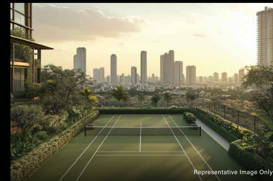
Representative Image Only