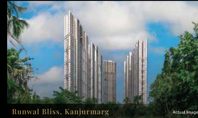
Runwal Bliss, Kanjurmarg