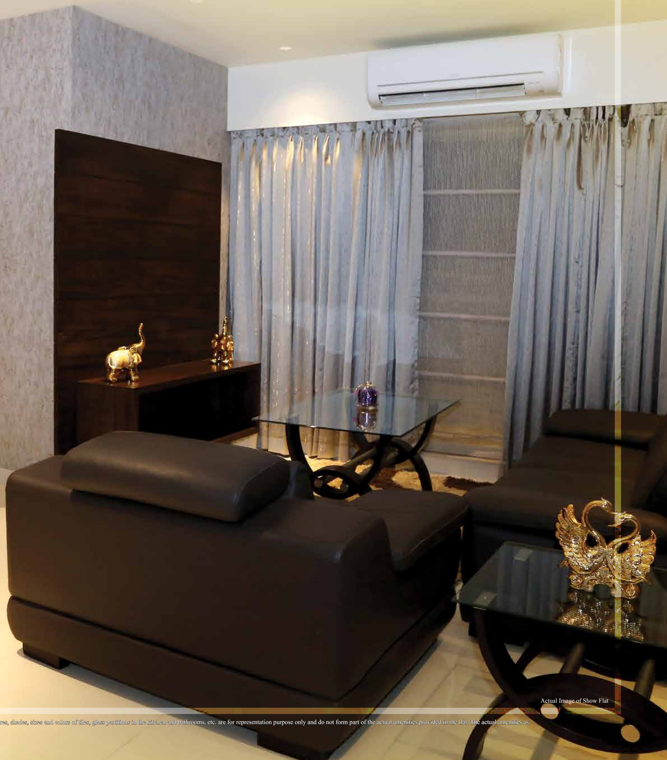
Actual Image of Show Flat

Disclaimer: The furniture, fixtures, accessories, paintings, electronic goods, fittings, decorative items, utensils, false ceiling, finishing material, specifications, features, shades, sizes and colors of tiles, glass partitions in the kitchen and bathrooms, etc. are for representation purpose only and do not form part of the actual amenities provided in the flat. The actual amenities as mentioned in the Agreement for Sale shall be final and provided in the flats.