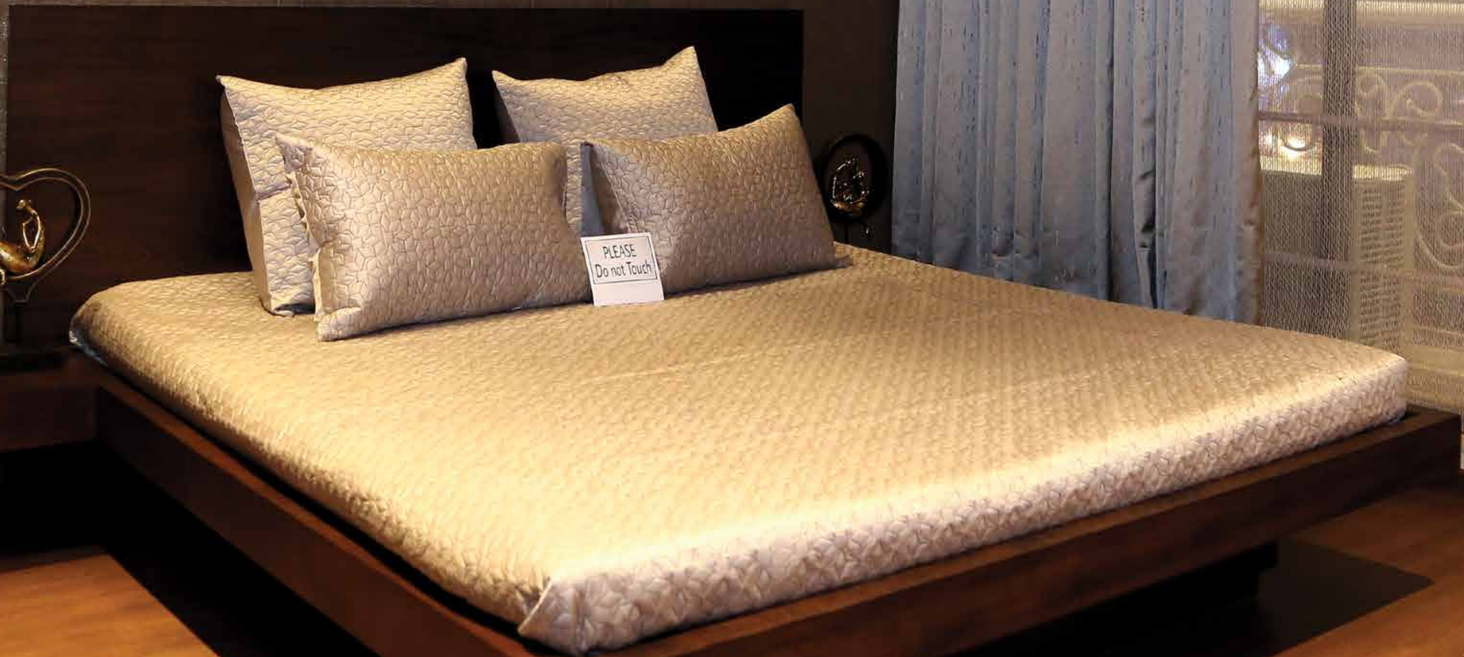
Actual Image of Show Flat