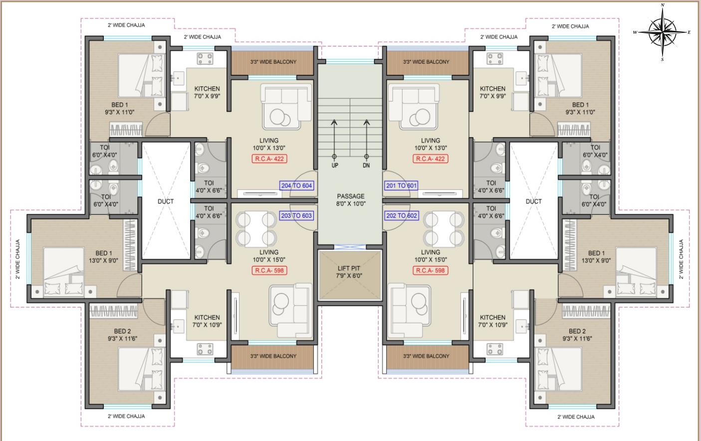
SECOND TO SIXTH FLOOR PLAN