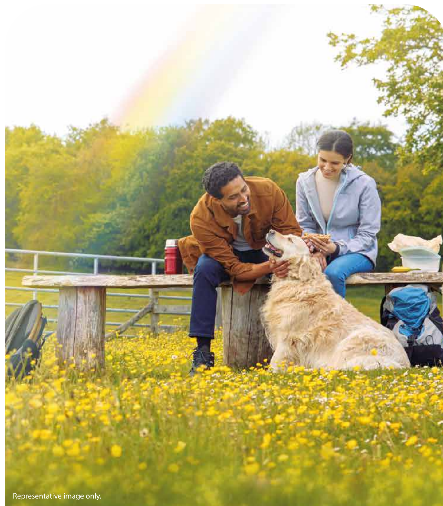
Representative image only.

BRIGADE OASIS Devanahalli BrigadeOasis.com