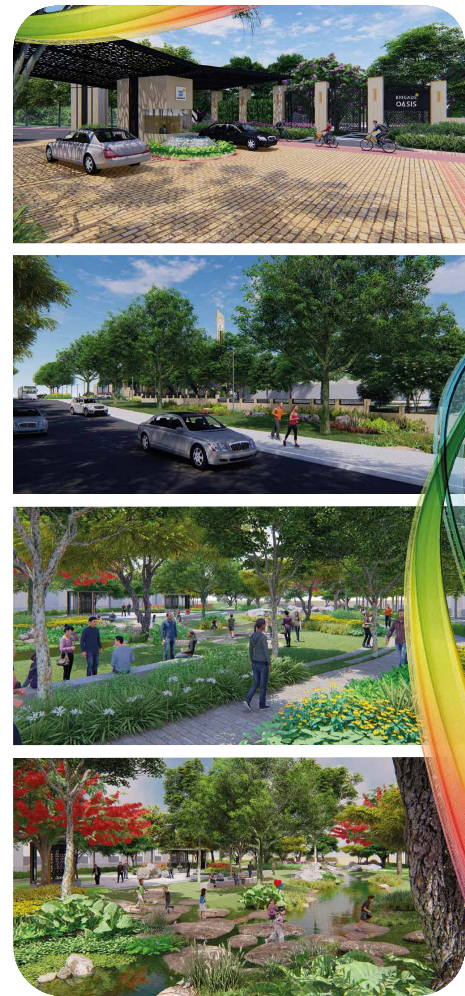
Artist's Impressions Disclaimer: All materials shown are indicative only