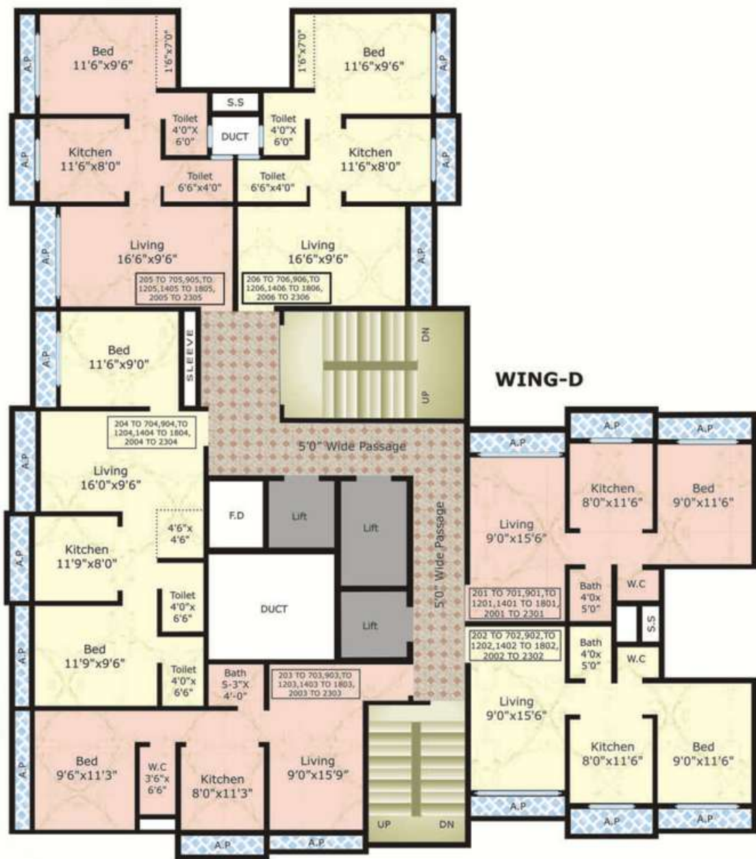
2nd to 7th, 9th to 12th, 14th to 18th & 20th to 23rd Floor Plan