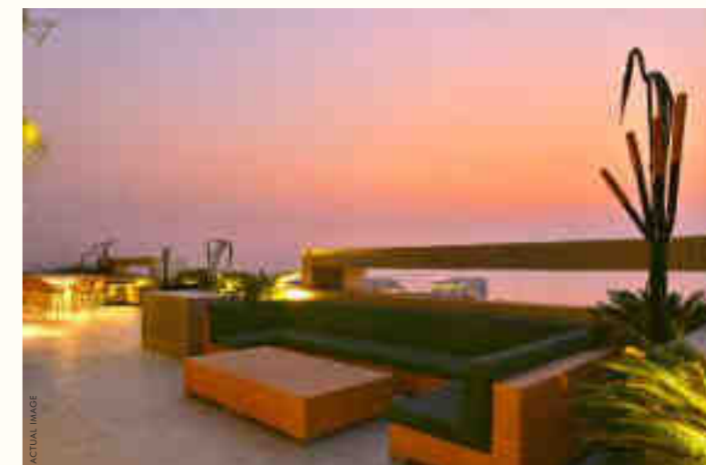
RUSTOMJEE PARAMOUNT | KHAR (W) A signature Gated Community with breathtaking vistas of the Arabian Sea.