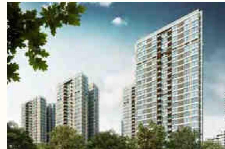
RUSTOMJEE SEASONS | BKC ANNEXE Spread over 3.8 acres, BKC's foremost Gated Community offers bespoke living experiences.