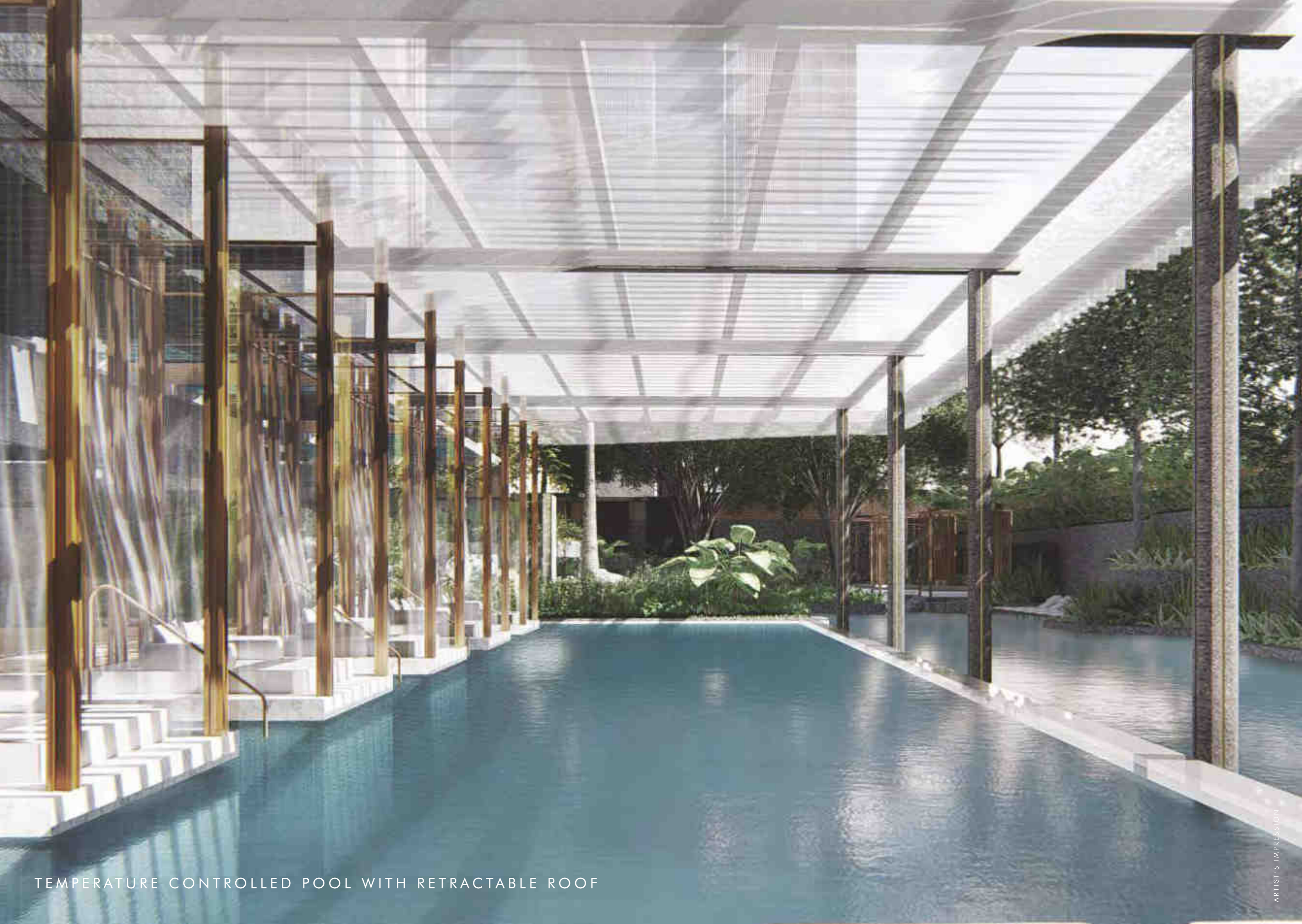
TEMPERATURE CONTROLLED POOL WITH RETRACTABLE ROOF