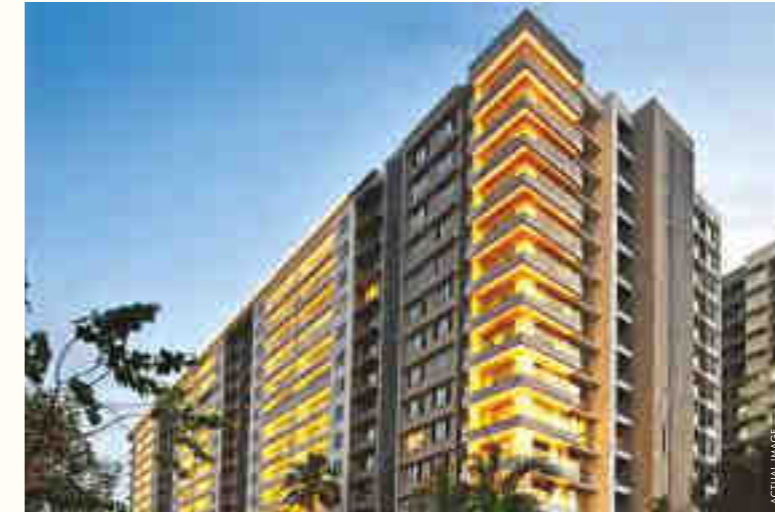
RUSTOMJEE ELEMENTS | OFF JUHU CIRCLE Located Off Juhu Circle, Rustomjee Elements is one of the most luxurious Gated Communities in the city of Mumbai.

12,300 HOMEOWNERS | COMPLETED OVER 14.2 MILLION SQ FT OF CONSTRUCTION 215 COMPLETED BUILDINGS | 30,000+ RUSTOMJEE FAMILY MEMBERS | 35 PROJECTS 2 TOWNSHIPS SPREAD ACROSS HUNDREDS OF ACRES | GATED COMMUNITIES