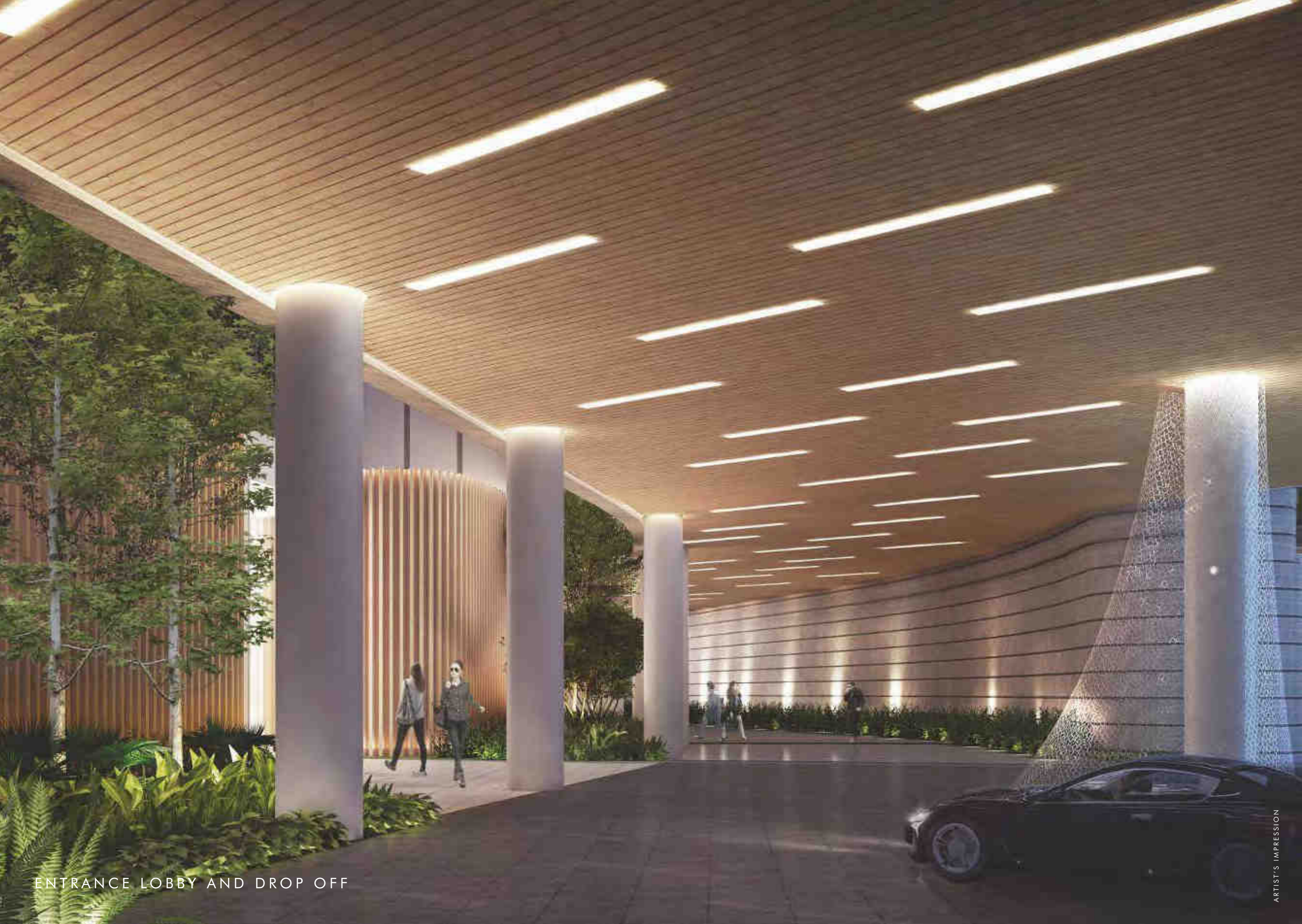
ENTRANCE LOBBY AND DROP OFF