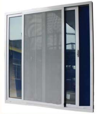
UPVC sliding window with Mosquito Netlon