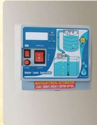
Automatic Water Level Controller