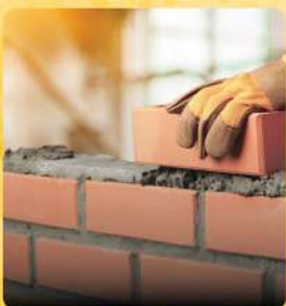
Red Bricks Construction