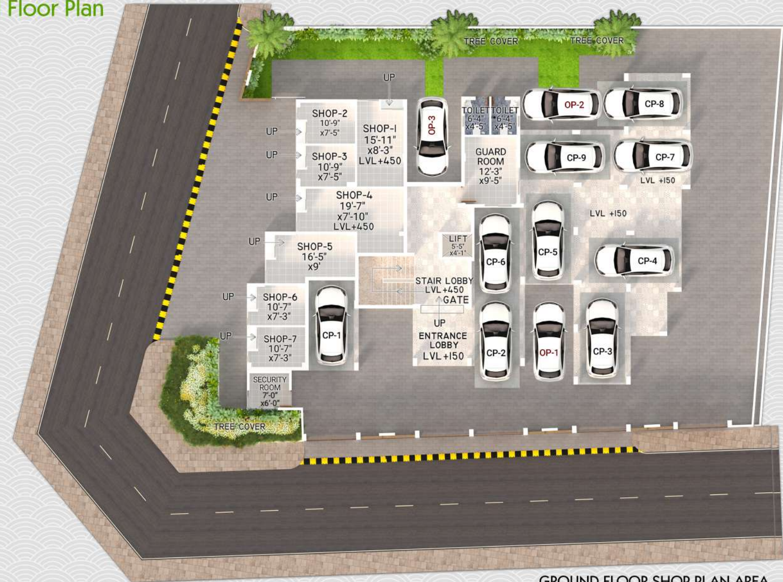
GROUND FLOOR SHOP PLAN AREA