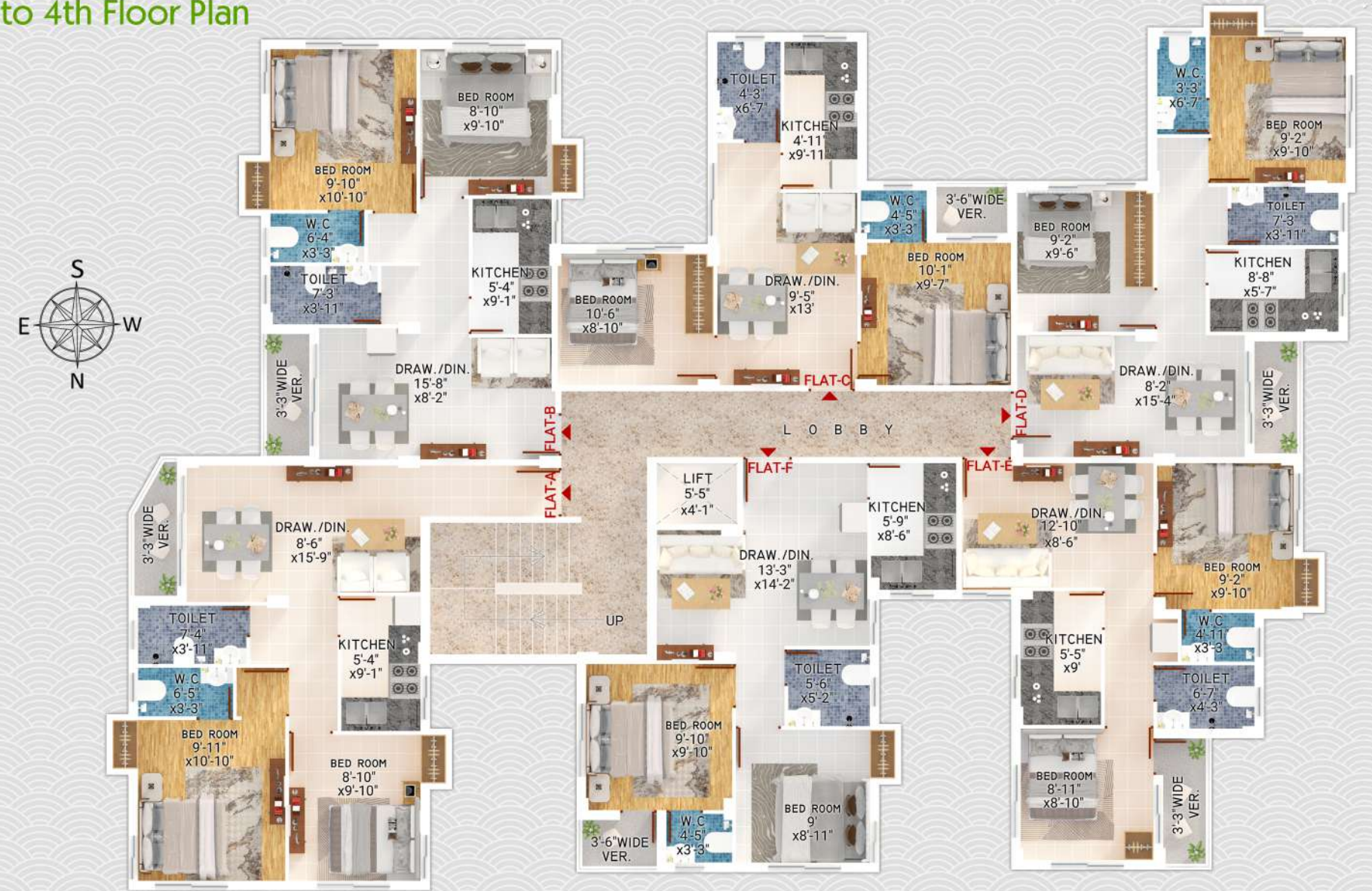
FLOOR PLAN AREA