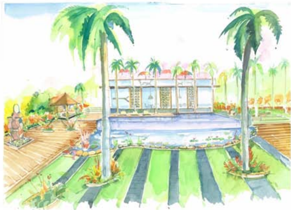
Swimming Pool and Pond

Let your mind float along with the fluidity of tranquility in the crystal clear water of strategically carved out pool.