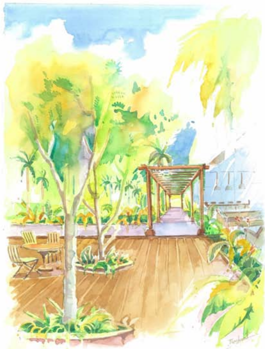
Senior Citizen Sit Outs

Imbibe the completeness of your being when you become one with nature.