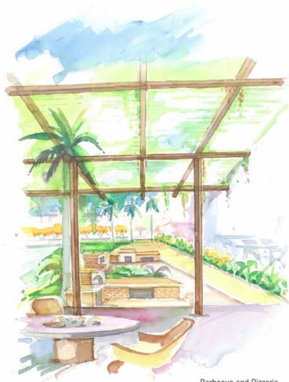
Barbecue and Pizzeria