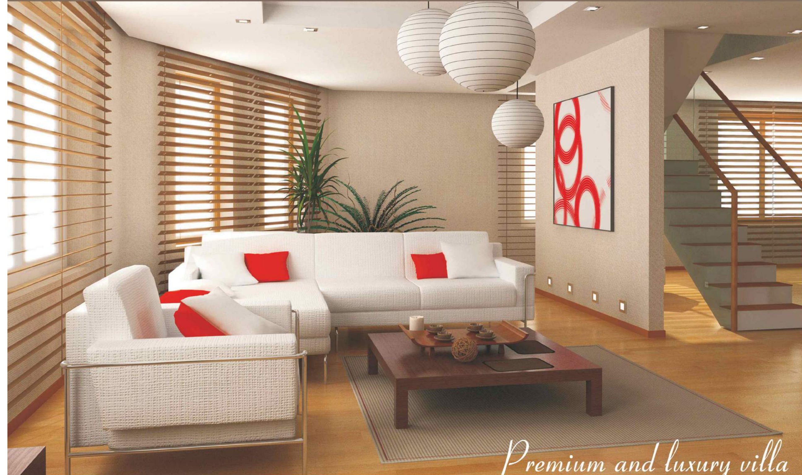
Premium and luxury villa