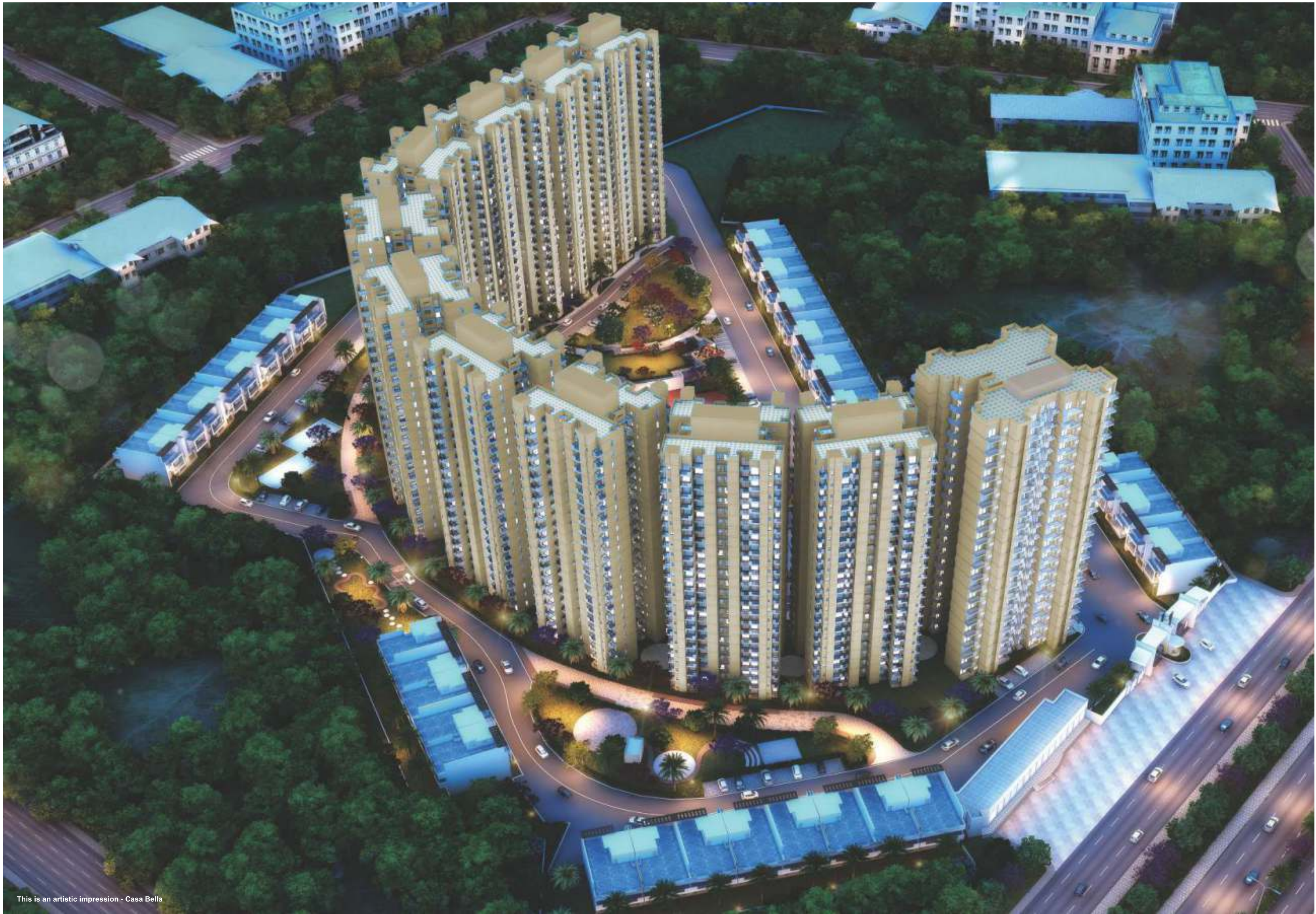
This is an artistic impression - Casa Bella