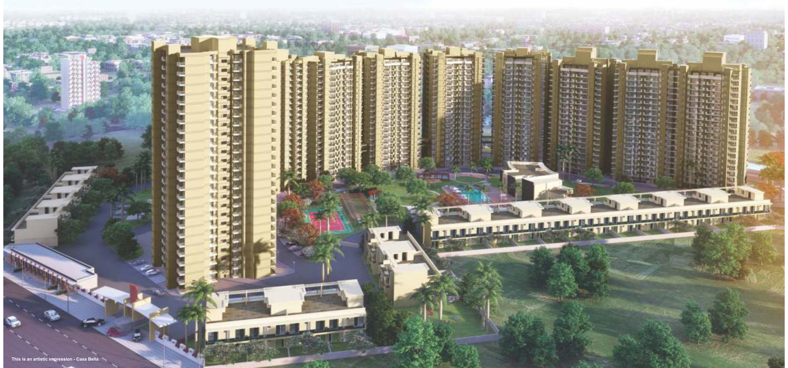
This is an artistic impression - Casa Bella