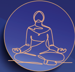
YOGA AND MEDITATION CENTER