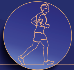
SCENIC ROOFTOP WALK TRAIL

"Legend Is Back" proudly features an RCC Frame Structure with mechanized parking, ensuring its longevity matches that of the residential tower, offering maintenance-free parking for years to come. The grand entrance lobby, elegantly designed, sets the tone for your extraordinary living experience. What's more, our planning ensures perfect ventilation and maximizes space utilization, offering added convenience and comfort. With thoughtfully designed homes, we offer various configurations to match your budget and preferences, considering every detail to make your living experience truly exceptional.