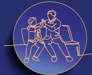
SENIOR CITIZEN SIT-OUT AREA