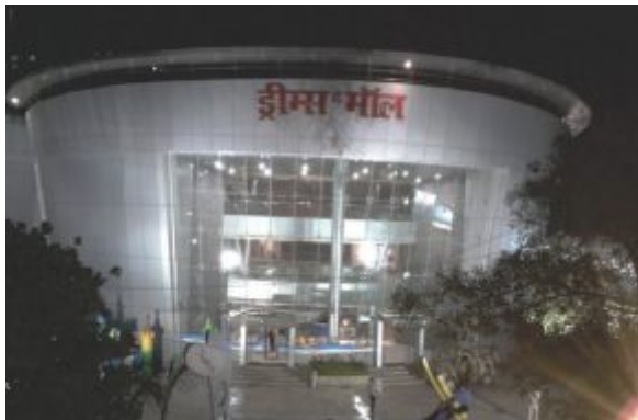
Shopping Malls - Neptune Magnet, Dreams & Nirmal Lifestyle