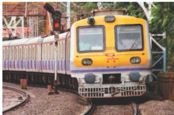
Bhandup railway station