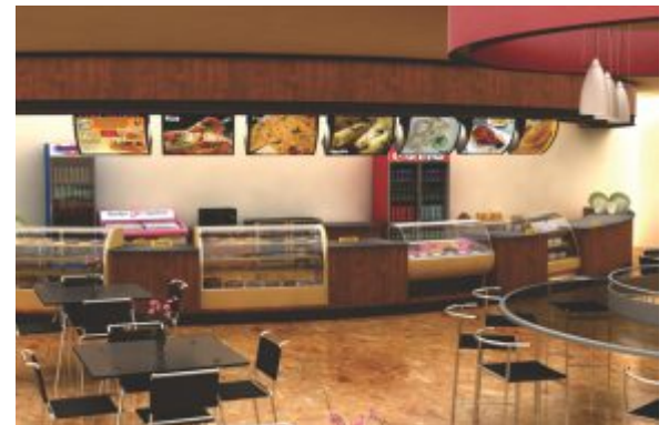
Fast Food & Dining - McDonald's, Food Wonder & Shera