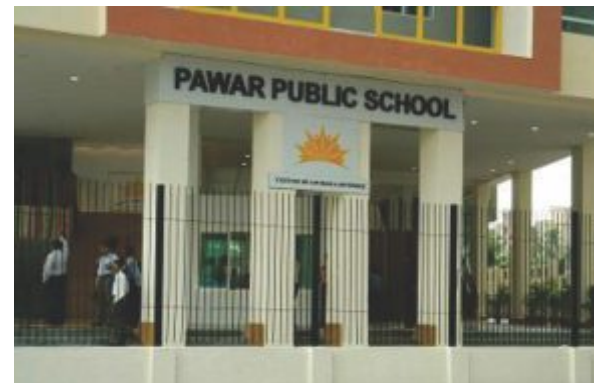
Educational Institutes - Pawar Public School

Disclaimer: The specifications, features, images and other details herein are only indicative. The promoters / developer reserve the right to change any or all of these specifications, features, images or any other details in the interest of the continuing improvement and development without prior intimation or obligation. This printed material does not constitute any offer and /or contract of any nature.