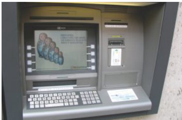
Banks & ATMs