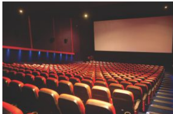
Multiplexes - Broadway, Cinepolis & PVR