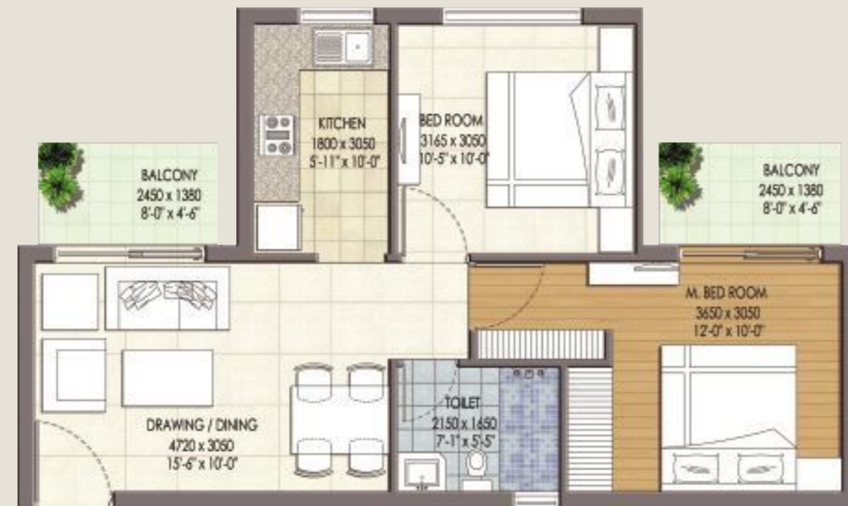
2BHK + 1TOILET - 820 SQ. FT: TYPE 1