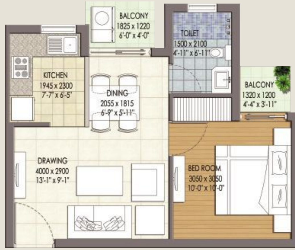
1 BHK + 1 TOILET - 555 SQ.FT.