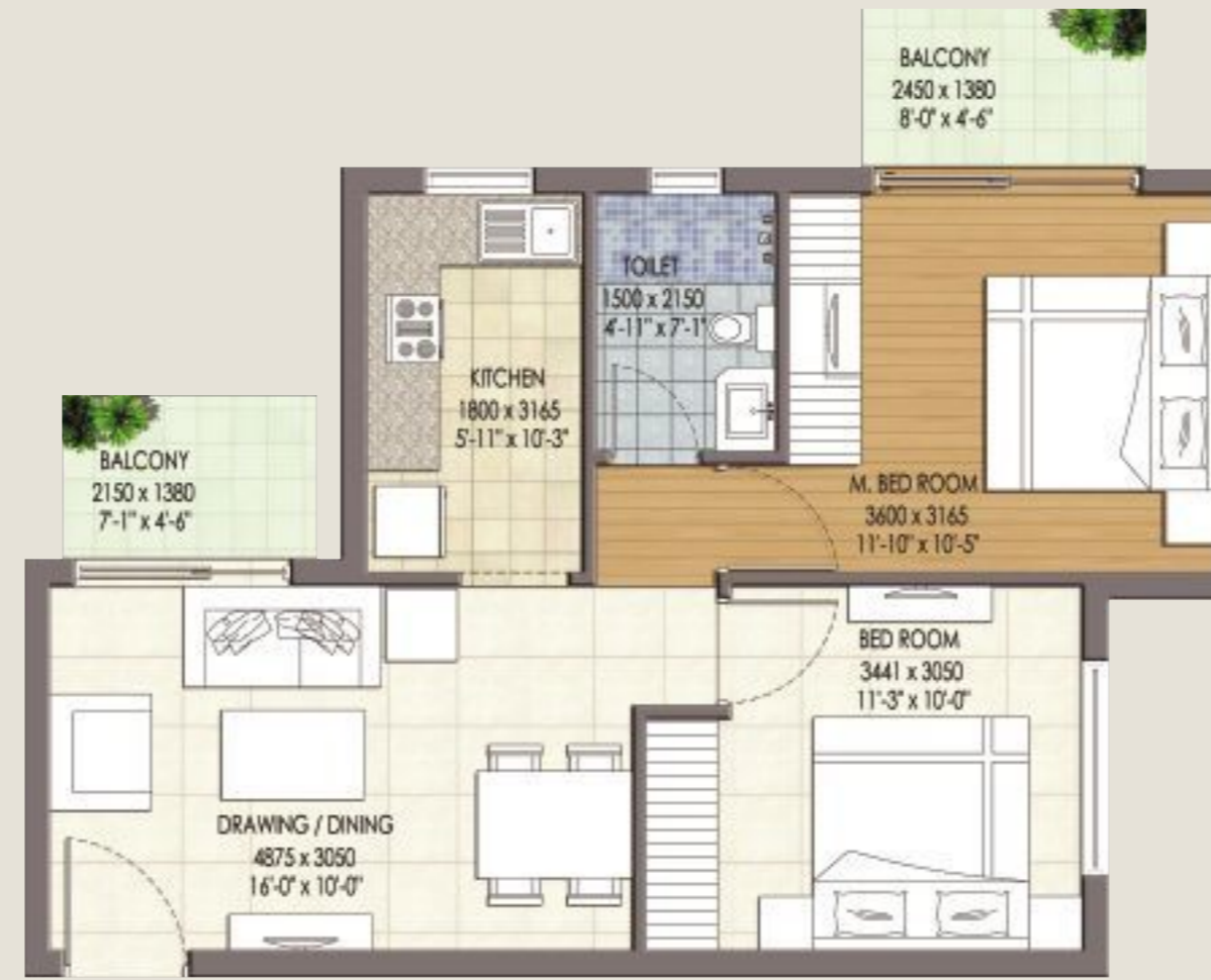
2BHK + 1TOILET - 820 SQ. FT: TYPE 2