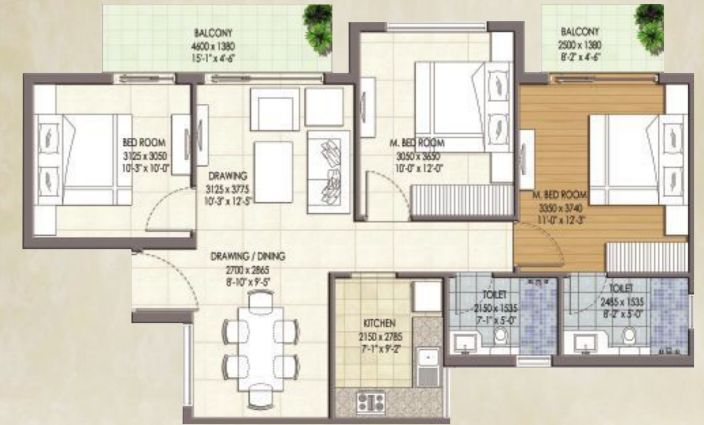
3BHK + 2 TOILET - 1210 SQ. FT.