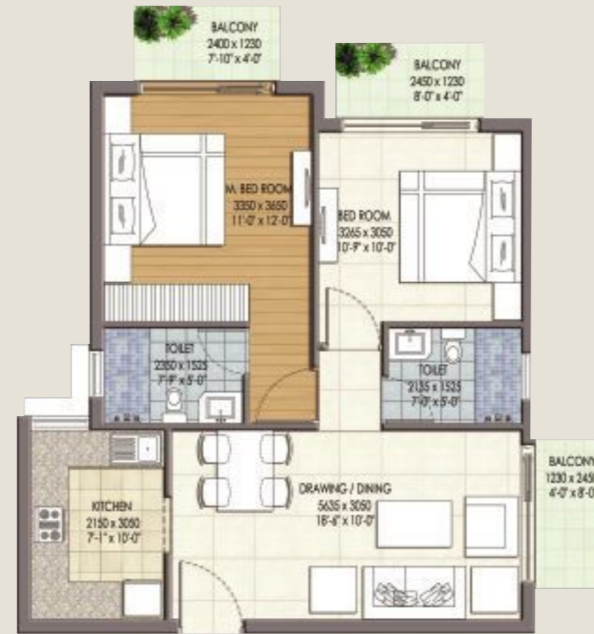
2BHK + 2TOILET - 980 SQ. FT.