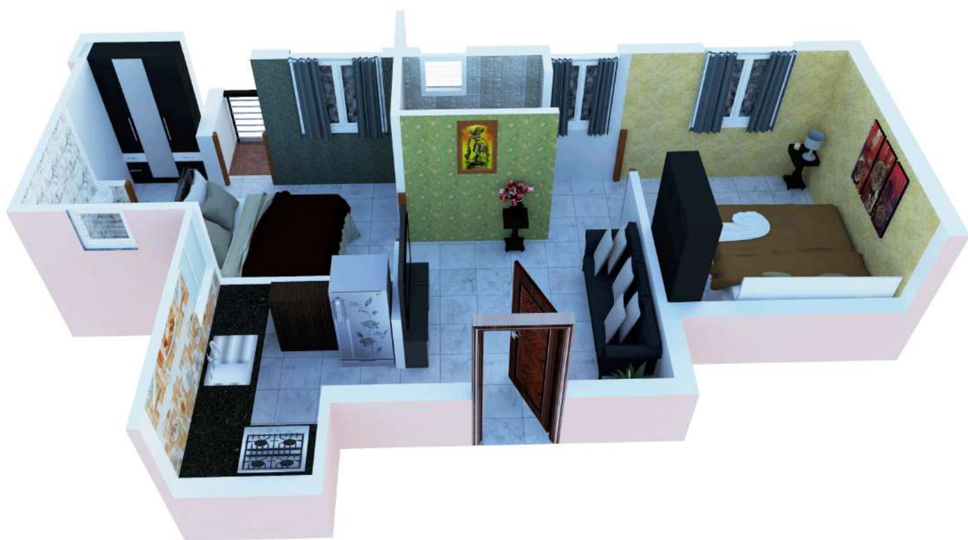
FIRST & SECOND (F2/S2- 668 SQ FT) EAST FACING