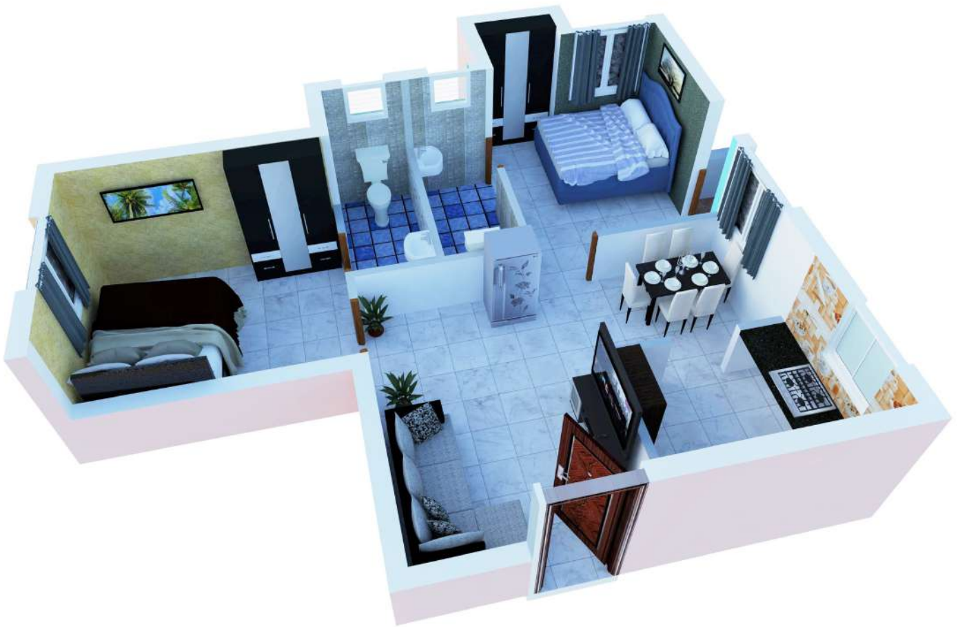
FIRST & SECOND (F1/S1- 799 SQ FT) SOUTH FACING