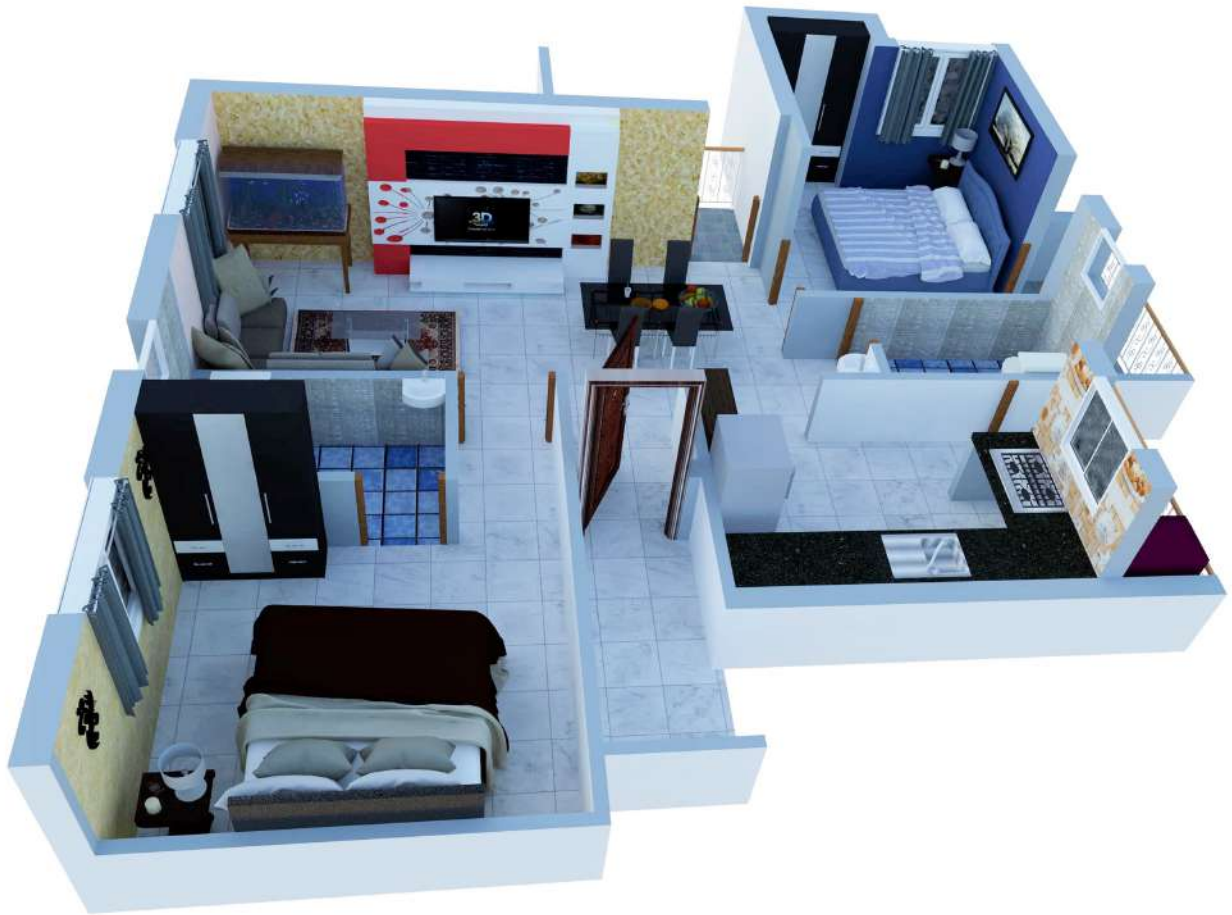
THIRD FLOOR (T1- 1055 SQ FT) SOUTH FACING