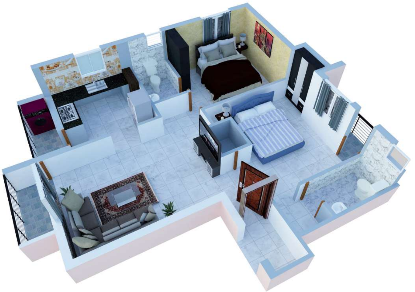
THIRD FLOOR (T2- 1065 SQ FT) NORTH FACING