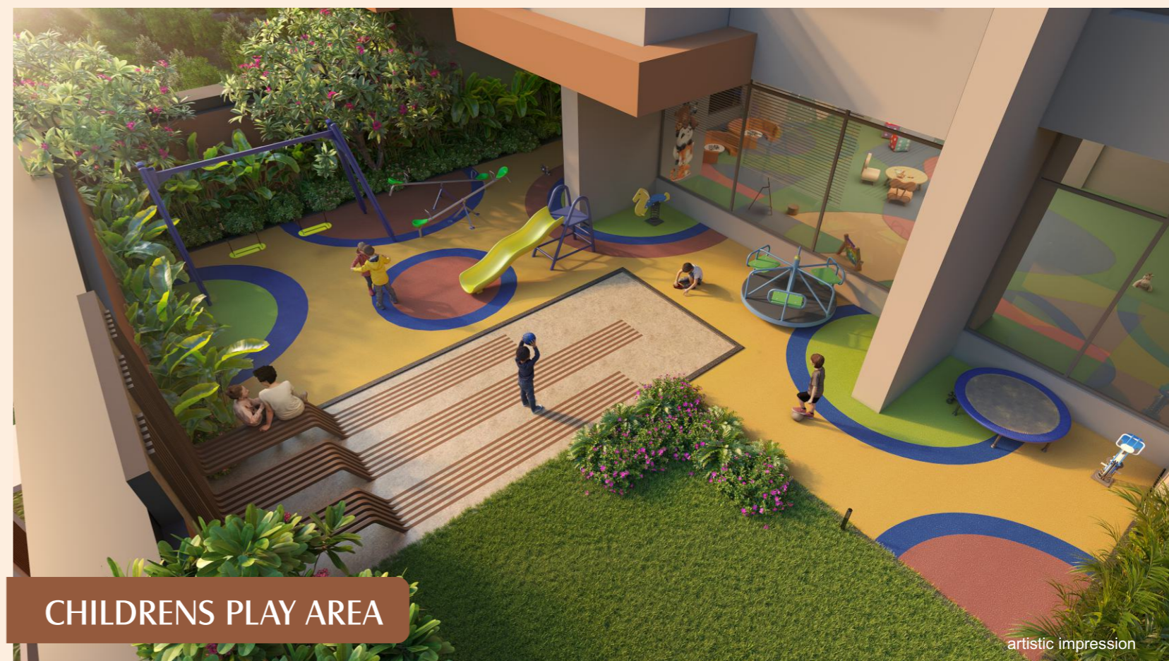
CHILDRENS PLAY AREA