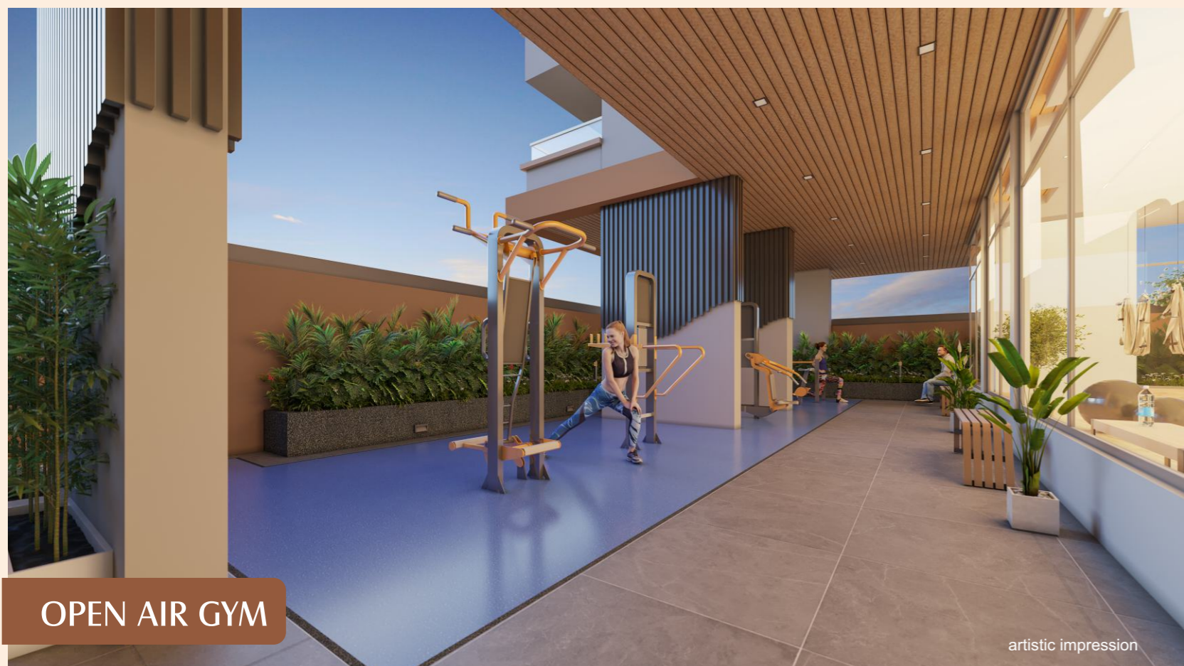
OPEN AIR GYM