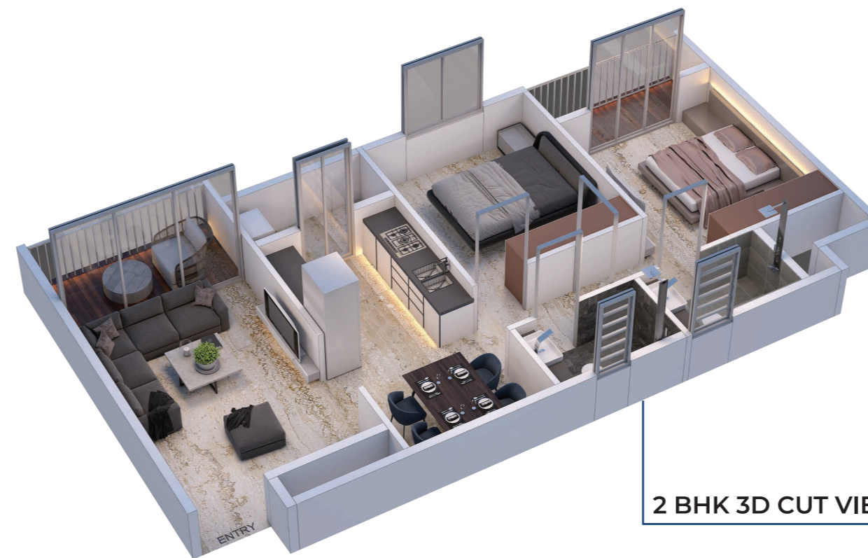
2 BHK 3D CUT VIEW