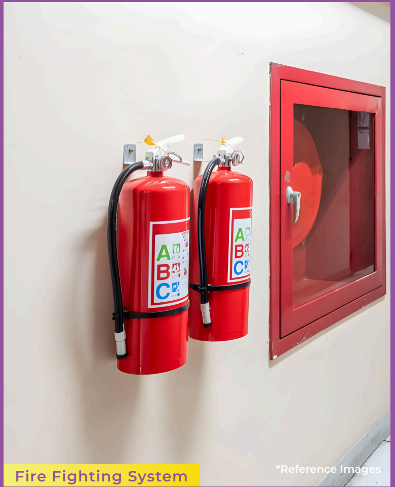
Fire Fighting System