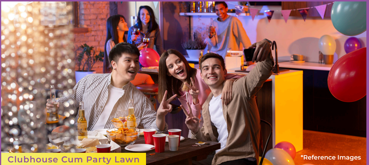
Clubhouse Cum Party Lawn