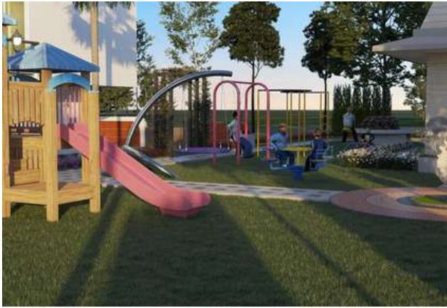
Children's Play Arena