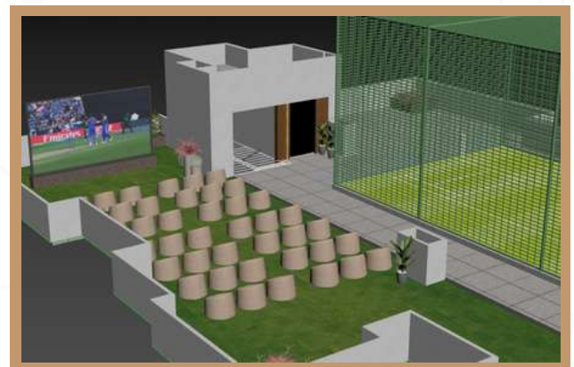
Sports Turf & Open Theatre