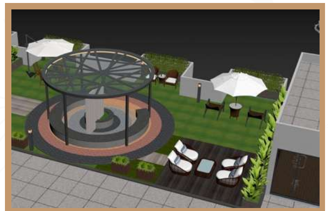
Landscaped Green Space