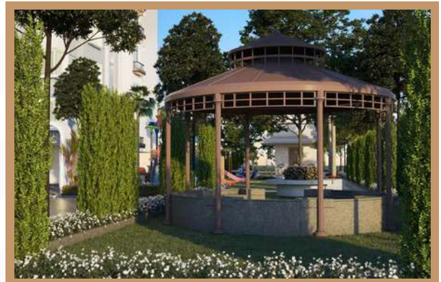
Senior Citizen Zone