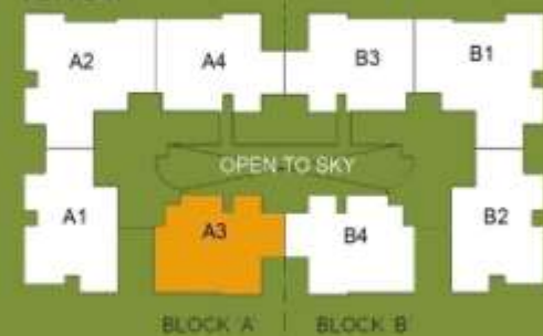
1ST FLOOR PLAN KEY PLAN

BUILT-UP AREA:- 1256 SFT FLAT NO.- A-103