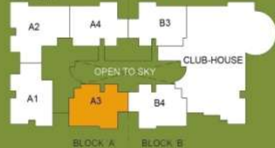
GROUND FLOOR PLAN KEY PLAN

BUILT-UP AREA:- 1231 SFT FLAT NO.- A-003