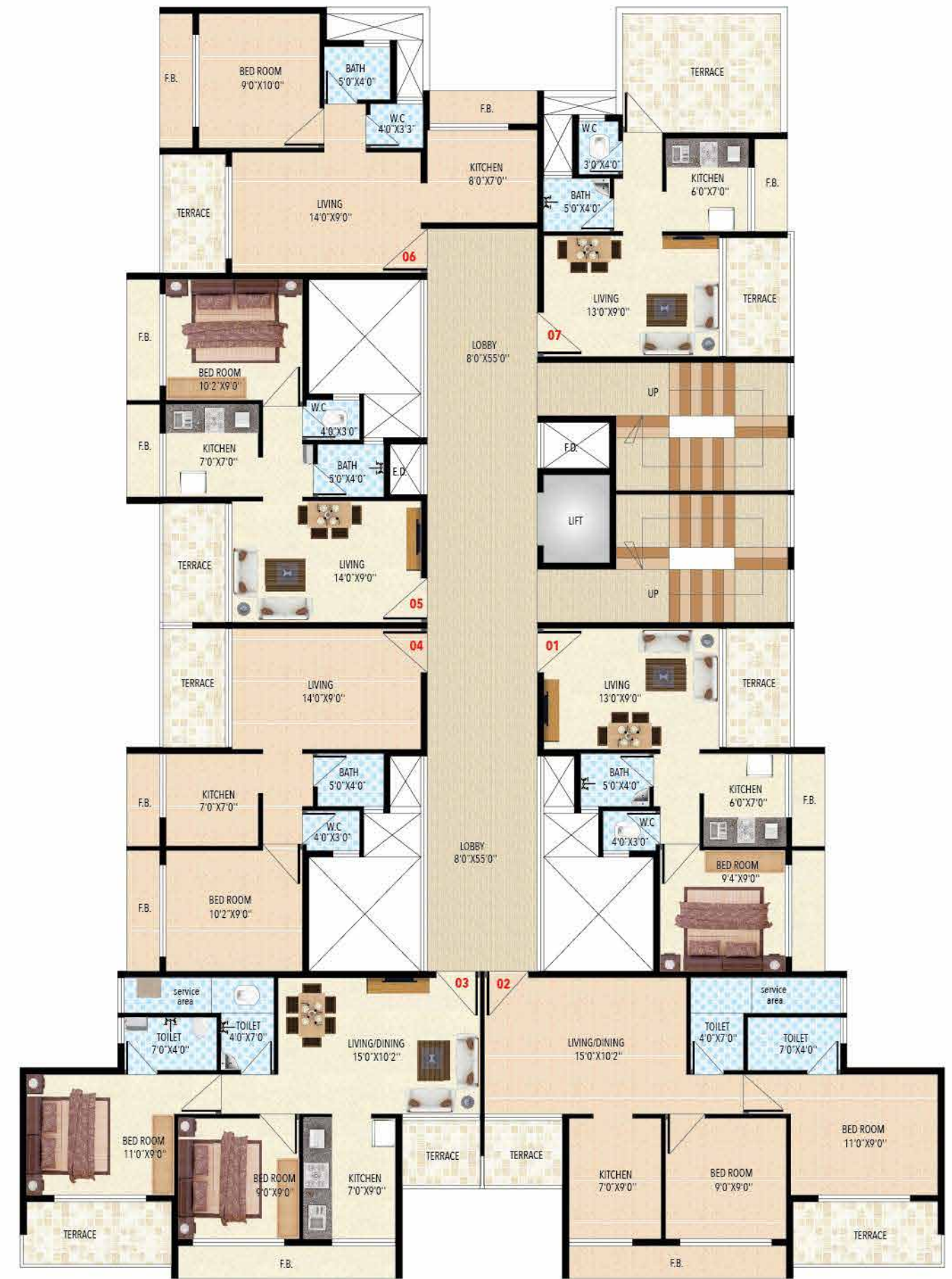
7th Floor Plan