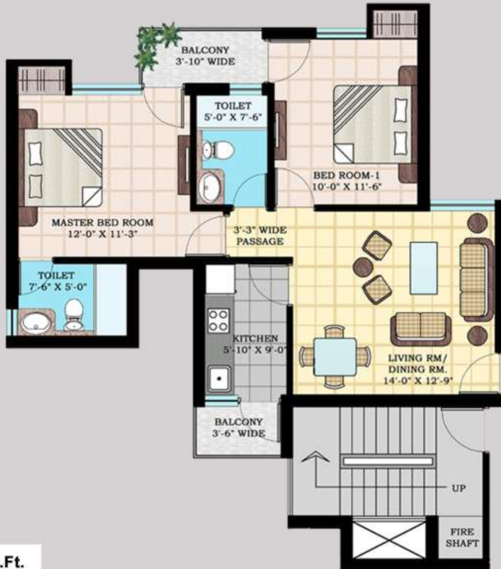
2 BR Unit : 865 Sq.Ft.