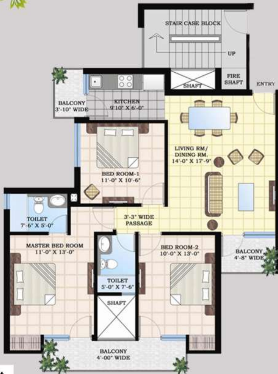
3 BR Unit : 1195 Sq.Ft.