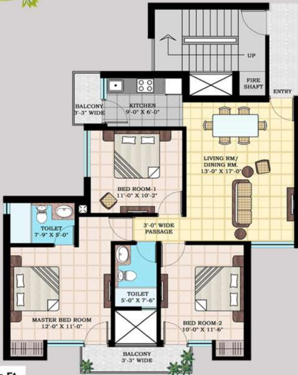
3 BR Unit : 1065 Sq.Ft.