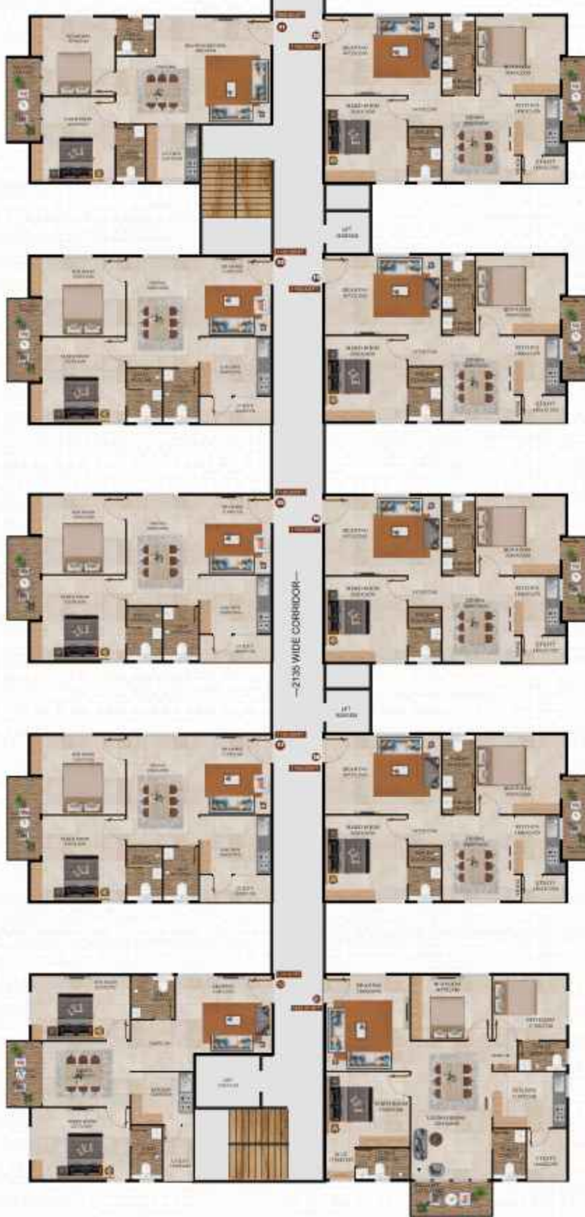
TOWER - 01 TYPICAL FLOOR PLAN