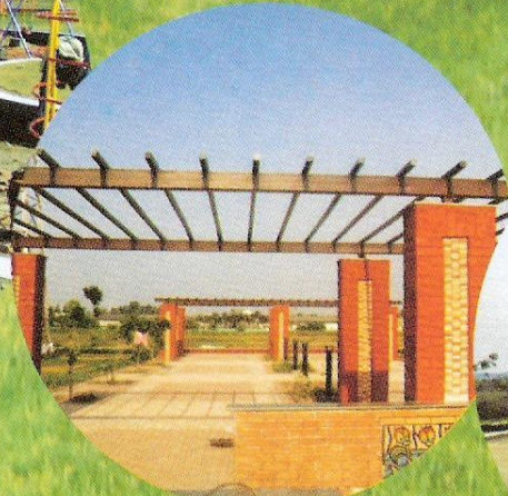
Lush green park