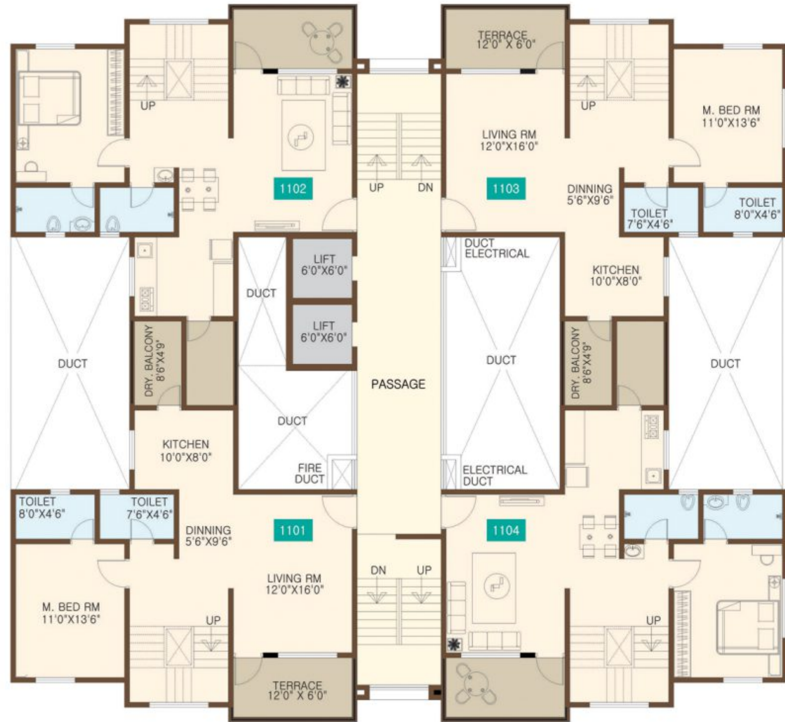
12TH FLOOR PLAN