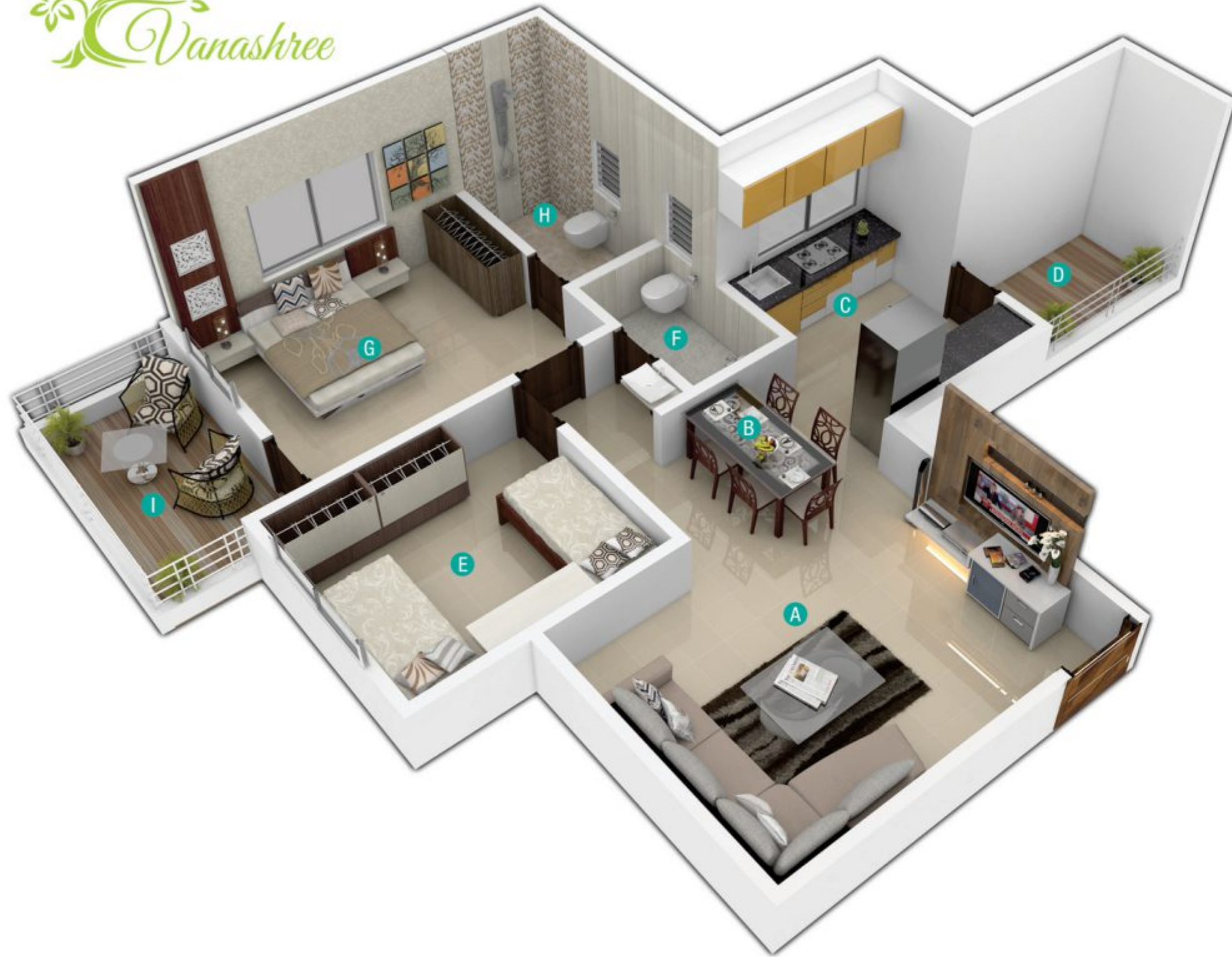
2 BHK APARTMENT EVEN FLOOR