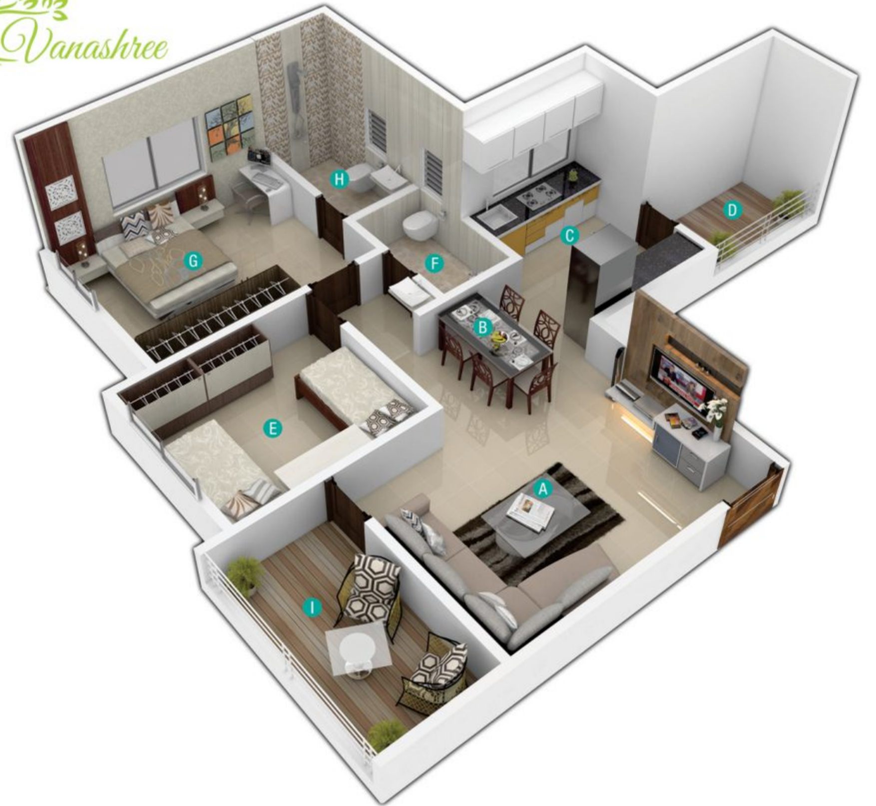
2 BHK APARTMENT ODD FLOOR