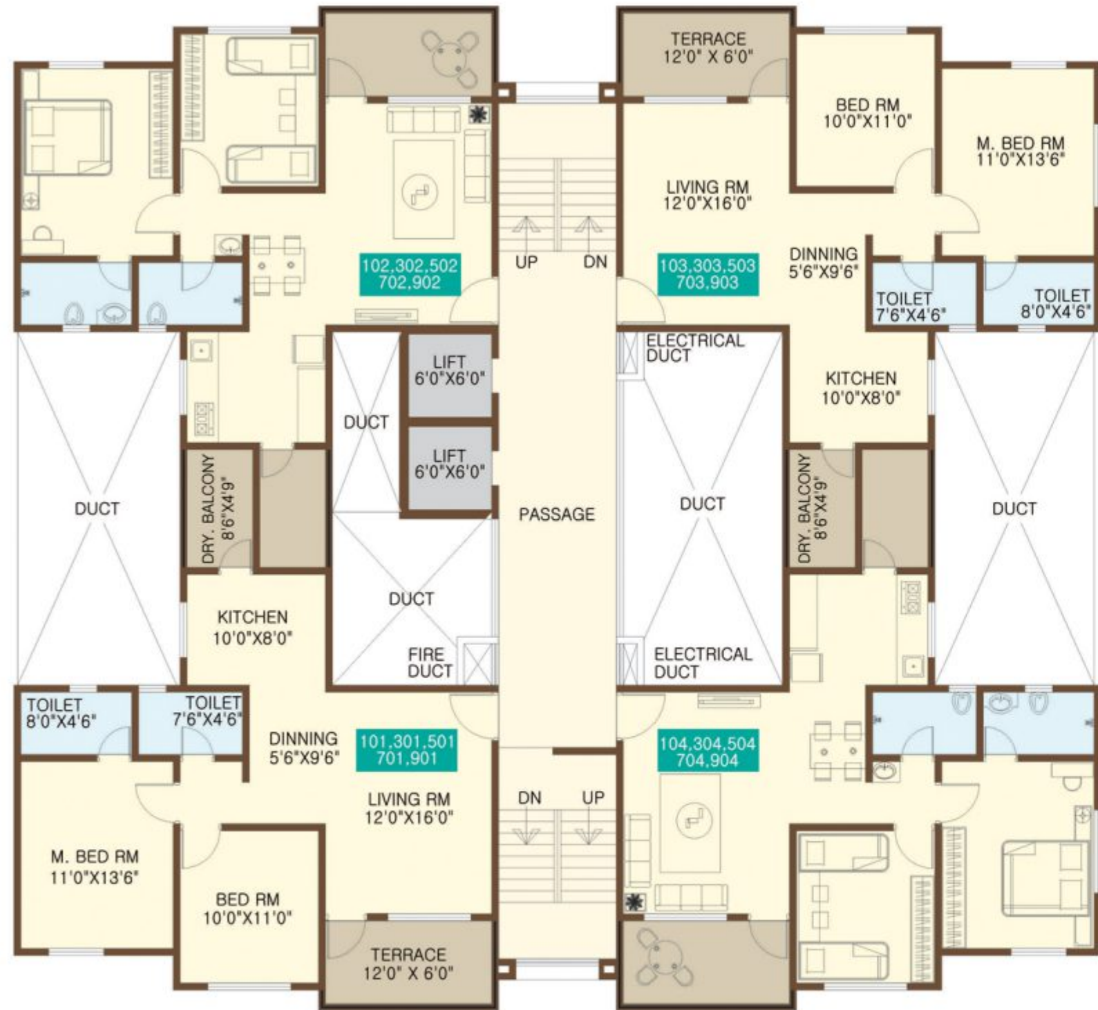
TYPICAL 1ST,3RD,5TH,7TH,9TH FLOOR PLAN