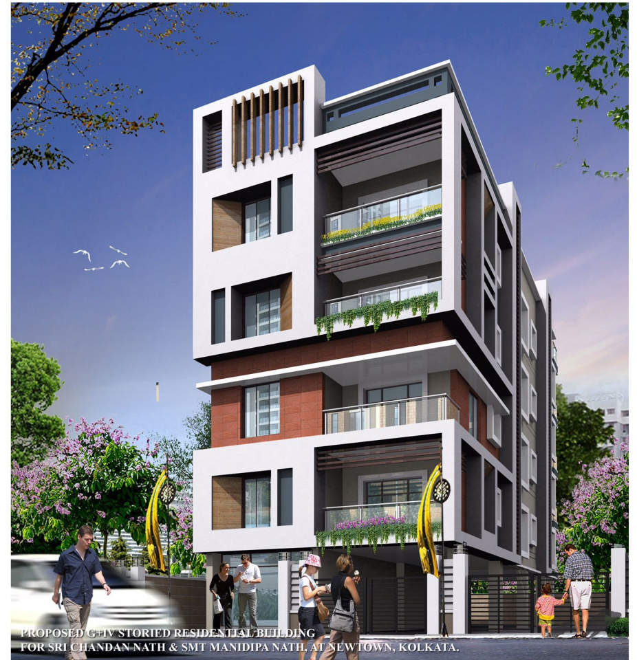
PROPOSED G+IV STORED RESIDENTIAL BUILDING FOR SRI CHANDAN NATH & SMT MANIDIPA NATH, AT NEW TOWN, KOLKATA.

The plans, specifications images and other details herein are only indicative and developers/owner reserves its right to change. The developers/owners websites and other advertising and publicity material include artistic impression indicating the anticipating of completed development