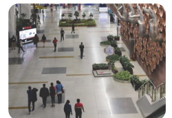
20 minutes IGI Airport