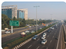
4 minutes NH-48