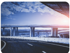
2 minutes Dwarka Expressway