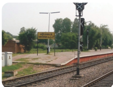
2 minutes Garhi Harsaru Junction