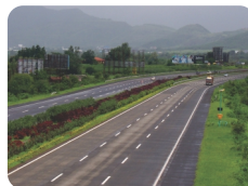
9 minutes Western Peripheral Highway