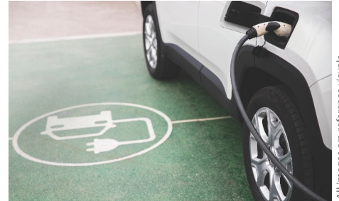
All images are reference visuals