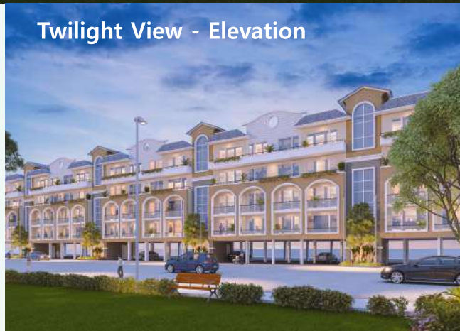
Twilight View - Elevation