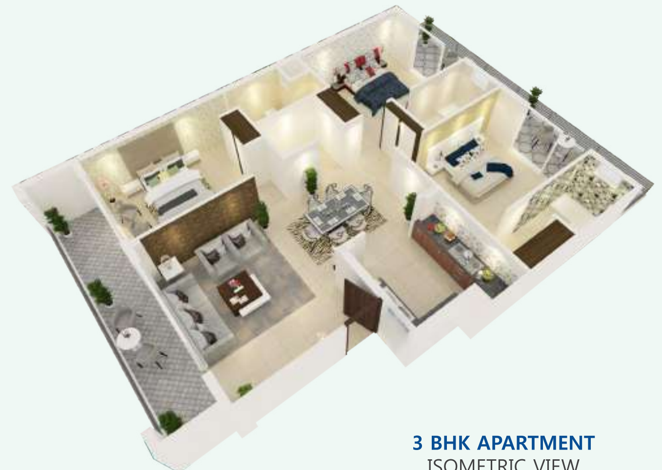
3 BHK APARTMENT ISOMETRIC VIEW