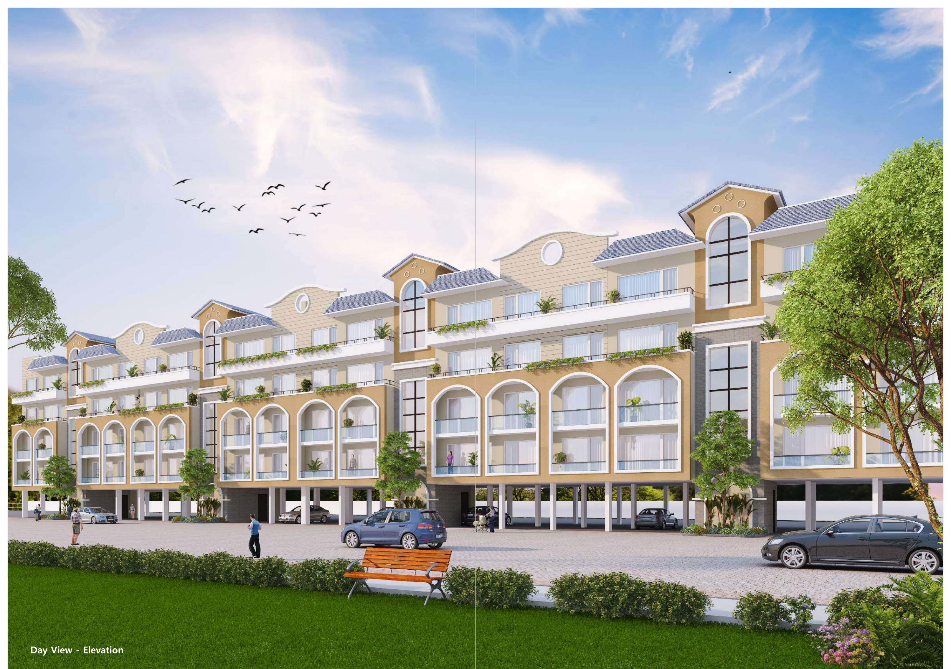
Day View - Elevation