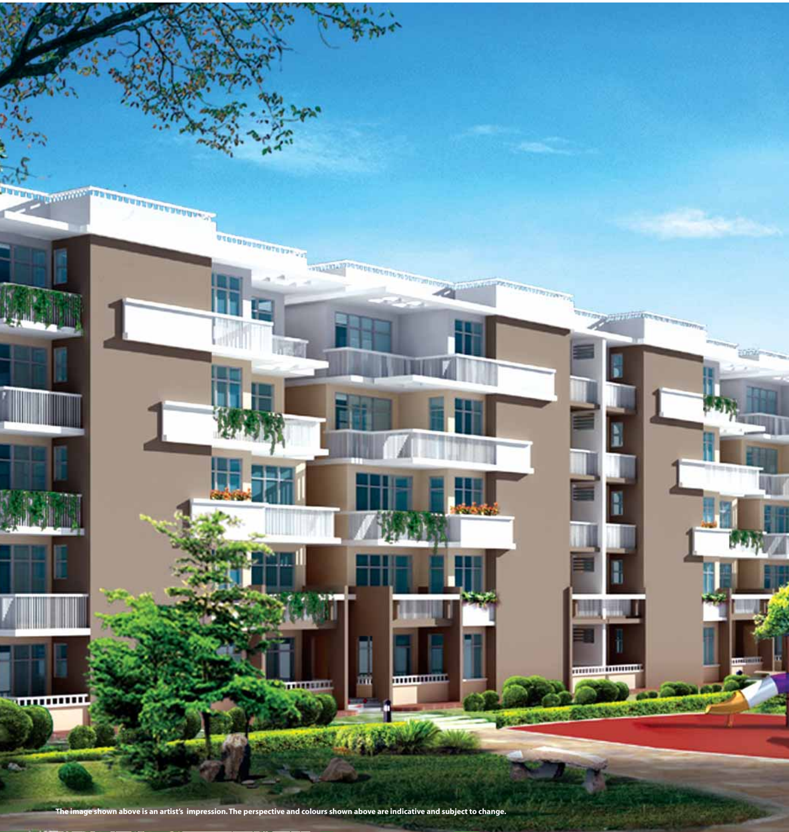
The image shown above is an artist's impression. The perspective and colours shown above are indicative and subject to change.