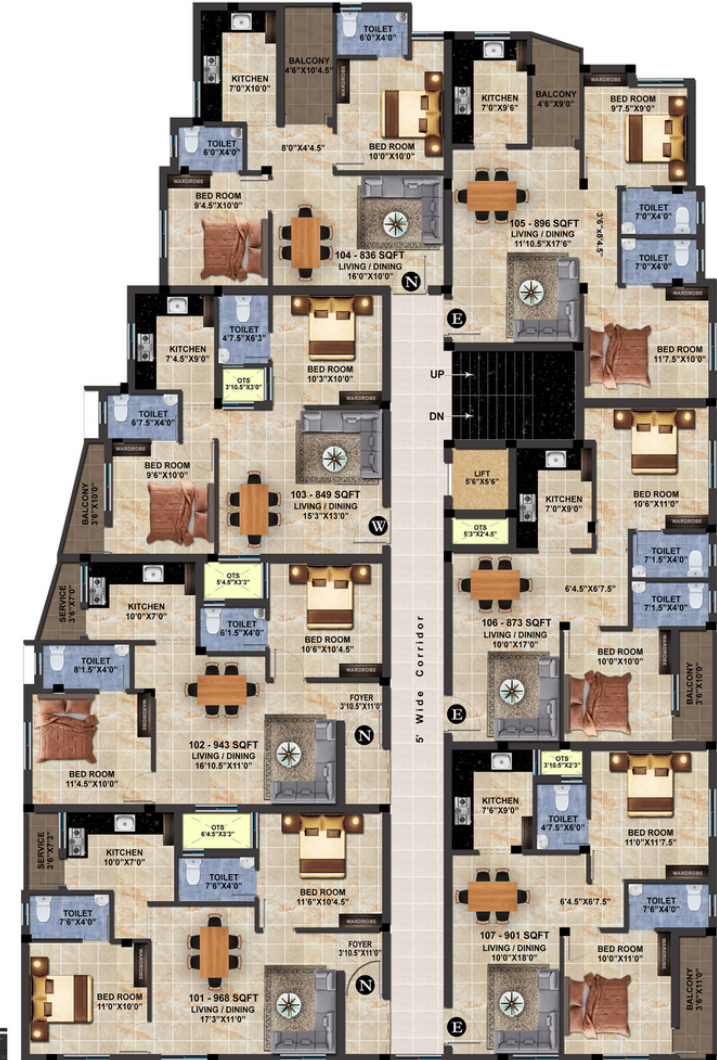
1st, 2nd, 3rd & 4th FLOOR