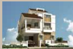
APARNA KANOPY LOTUS (Work in progress) 91 Value villas, Gundlupochampally, Kompally