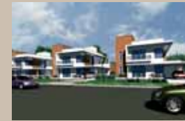
APARNA CYBER COUNTY (2009) 59 Independent villas, Gopannapally