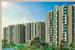
APARNA HILLPARK LAKEBREEZE (Work in progress) 943 Loveneests, Miyapur, Chandanagar