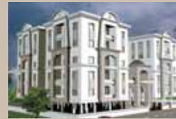
APARNA LAKE VILLA (2002) 20 High-end super deluxe apartments, Begumpet