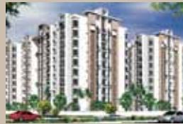
APARNA CYBER COMMUNE (2011) 730 Hi-end apartments, Nallagandla