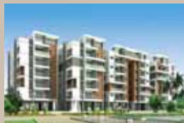
APARNA KANOPY TULIP (Work in progress) 360 Value apartments - Phase 1A Gundlupochampally, Kompally