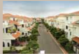
APARNA SENOR VALLEY (2005) 40 Designer villas, Jubilee Hills