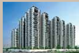
APARNA SAROVAR GRANDÉ (Work in progress) 720 Luxury Lifestyle Apartments, Nallagandla