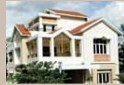
APARNA ORCHIDS (2006) 59 High-end independent villas, Hitex