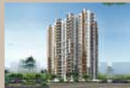
APARNA AURA (Work in progress) 135 Super Luxury Residential Apartments, Jubilee Hills