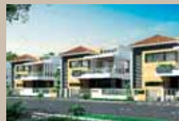
APARNA HILLPARK GARDENIA (Work in progress) 116 Premium Luxury Villas, Miyapur, Chandanagar