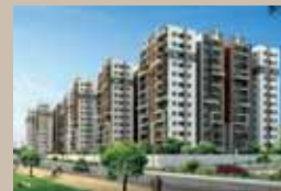
APARNA HILLPARK AVENUES Possession by June 2013 647 Smart Apartments, Miyapur, Chandanagar