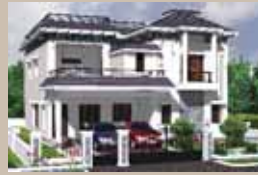
APARNA COUNTY (2008) 125 Independent villas, Hafeezpet