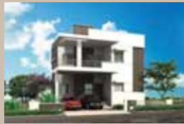
APARNA HILLPARK BOULEVARD (2012) 94 Premium villas, Miyapur, Chandanagar