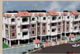
APARNA CHANDRADEEP (2006) 30 Ultra deluxe apartments, Banjara Hills