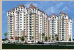
APARNA TOWERS (2008) 312 Super deluxe apartments, Kondapur