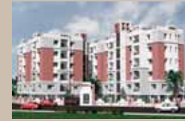
APARNA RESIDENCY (2006) 30 Elegantly designed apartments, Kondapur