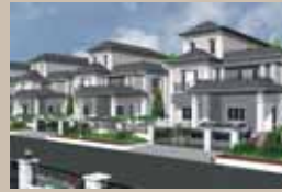
APARNA SHANGRI-LA (2008) 40 Independent villas, Gopannapally, Gachibowli