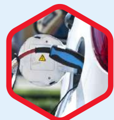
VEHICLE CHARGING POINT