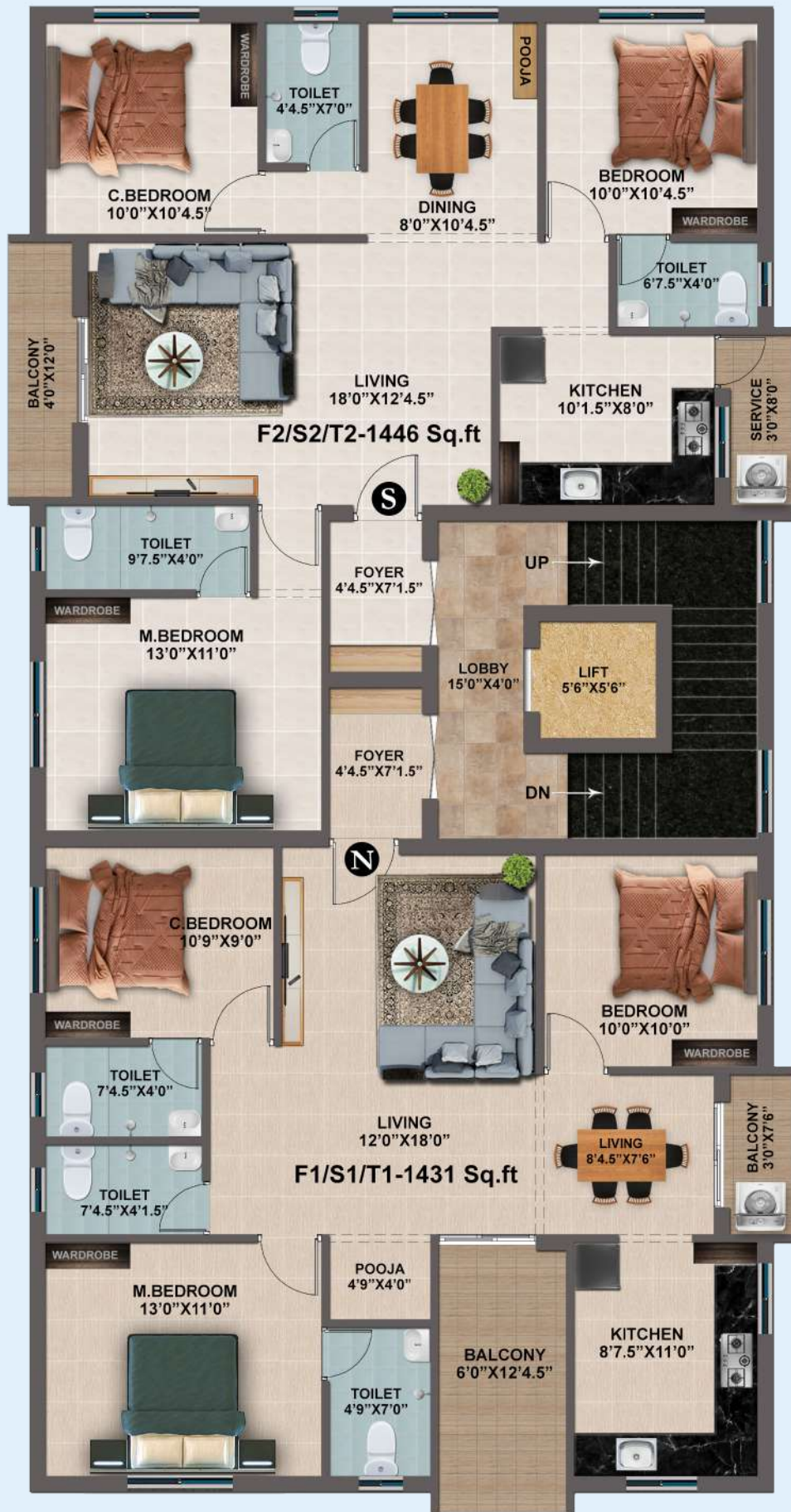
1 st , 2 nd & 3 rd TYPICAL FLOOR PLAN