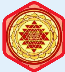
VAASTU COMPLIANT PLANNING