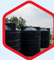
TANK FLOAT LEVEL SWITCH