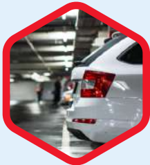
STILT COVERED CAR PARKING